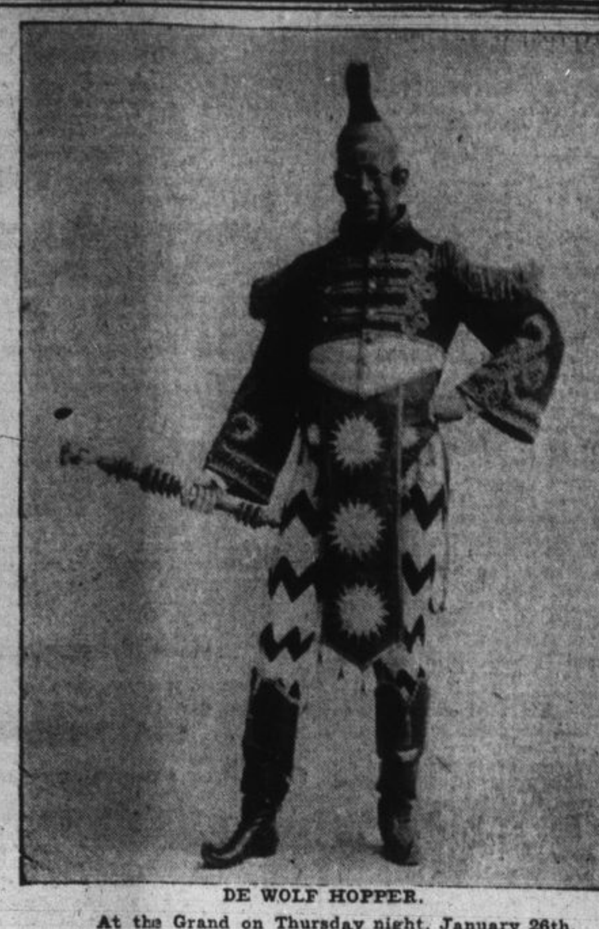
At the Grand on Thursday night, January 26th.