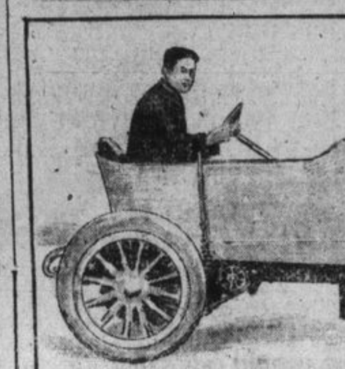
The new six-cylinder 90-horse power Pope Toledo, built to track the mile record of 39 seconds, in connection with the great automobile meet at Ormonde, Fla., in January.