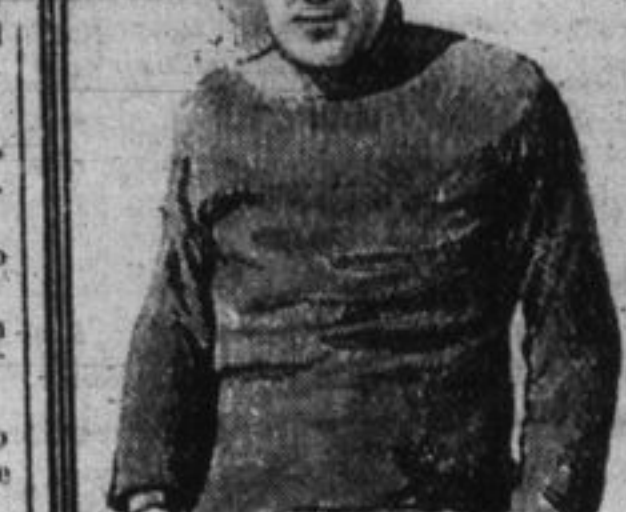
Yale's hope in test of strength.