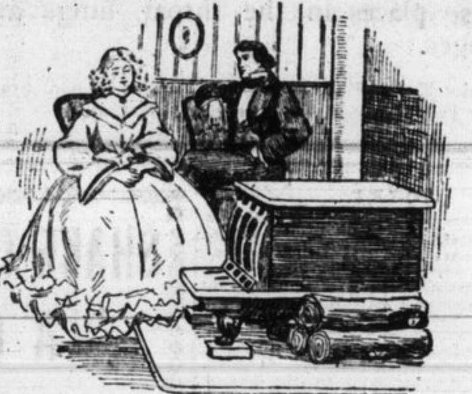
Our grand-parents sat by the old box stove with chilly backs and burning faces.