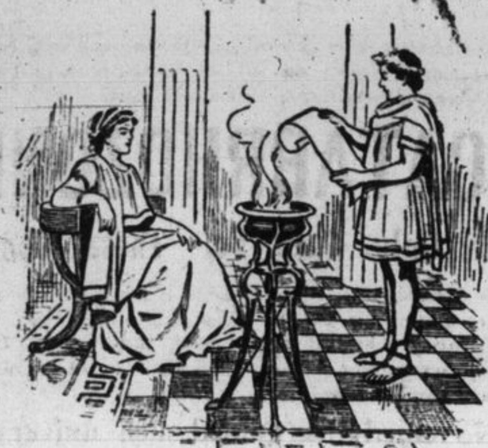
The charcoal brazier of ancient Rome was beautifully wrought but gave little comfort.

Oxford Hot Water Boilers are made of the best cast iron and will not rust even when the water lies in them all summer.