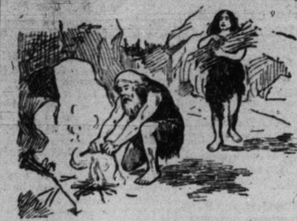
Pre-historic man crouched around a brush fire to keep himself warm.

The Elizabethan Age produced nothing better than the open fire-place with its draughty rooms.