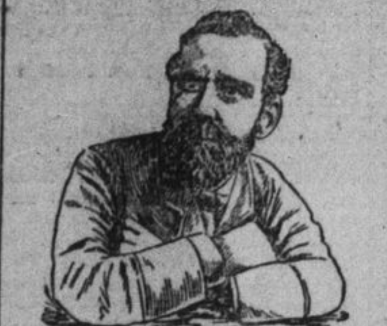
EDITOR W. T. STEAD.

London, Dec. 2.—W. T. Stead will start a new paper here probably under the title of "The Daily Paper." He proposes to get 200,000 subscribers in London and to deliver the papers at each door between ten and twelve o'clock in the morning, after the men have gone to business, when the women and children will have an opportunity to read it. The paper will cost a penny.