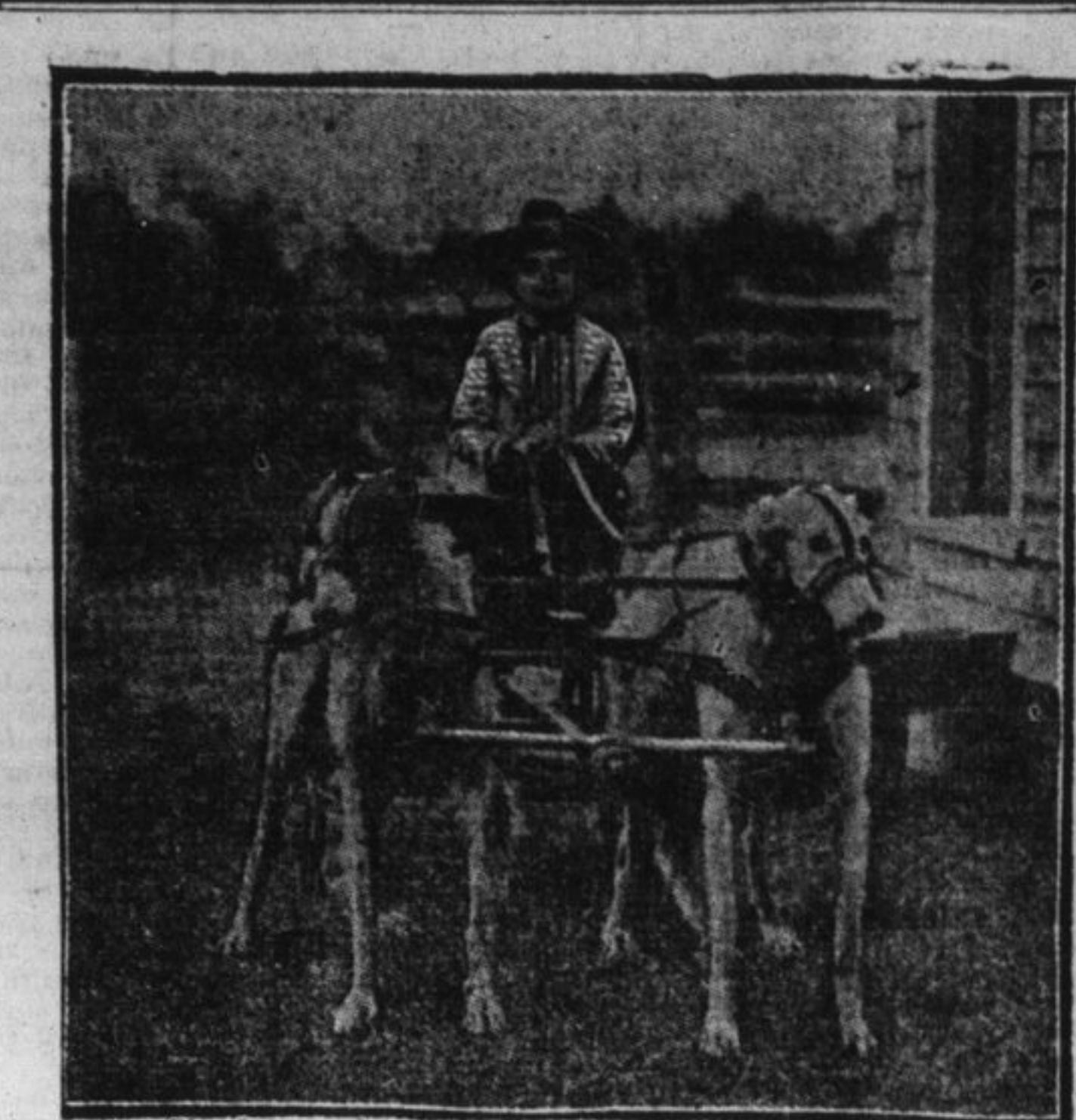
A UNIQUE DOG CART.

When the Earl of Lillithgow was a boy he had a particularly fine fleet of miniature ships manned by small boys from the estate, dressed as men-of-war. Once, when the King of Denmark, was on a visit to Hopetoun house, he reviewed the little fleet and, struck by the smart appearance of one of the small "handy men," approvingly patted him on the head. The child, apparently overcome by the unexpected honor, handed his miniature rig so awkwardly that he did, sharply prod the royal waistcoat with his bayonet. The future earl, who was then about fifteen, was at forward heard to reprimand the offender thus: "When a King pats you on the head, don't prod him in the stomach, salute him!" If there ever was a specific for any one complaint, then Carter's Little Liver Pills are a specific for sick headache, and every woman should know this. Only one pill a dose. Try them.