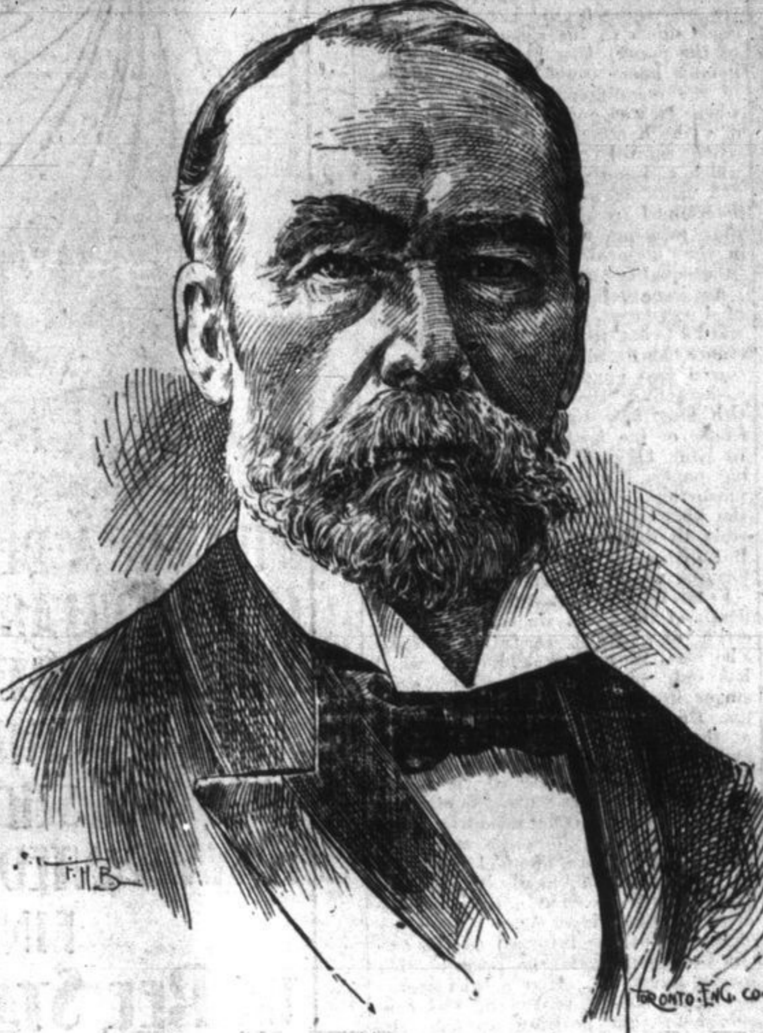
HON. G. W. ROSS Ontario's Loyal and Large Hearted Premier.

It has been decided to hold a celebration at Tweed Park on Dominion day. The woman who can't fool some man is probably alone on a desert island. Perhaps they made the sphinx mostly lion in order to have her keep her secret.