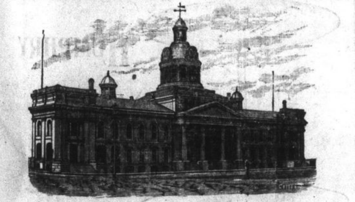
Built in 1842, in which the 5th R.oyal Scots will be quartered.

ers in their ranks. Again in 1885 the corps was under orders to be in readiness to proceed to the North-West to take part in subduing the rebellion, but fortunately their services were not required.