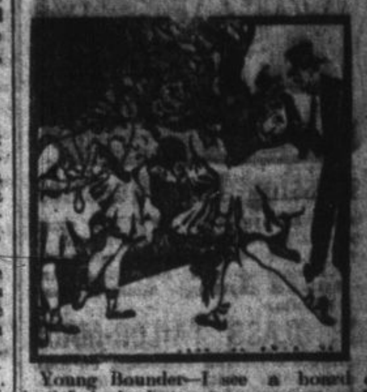
Young bander—Lose a honest of health is in hot water over an odd case prohibiting crawling woman's dress.