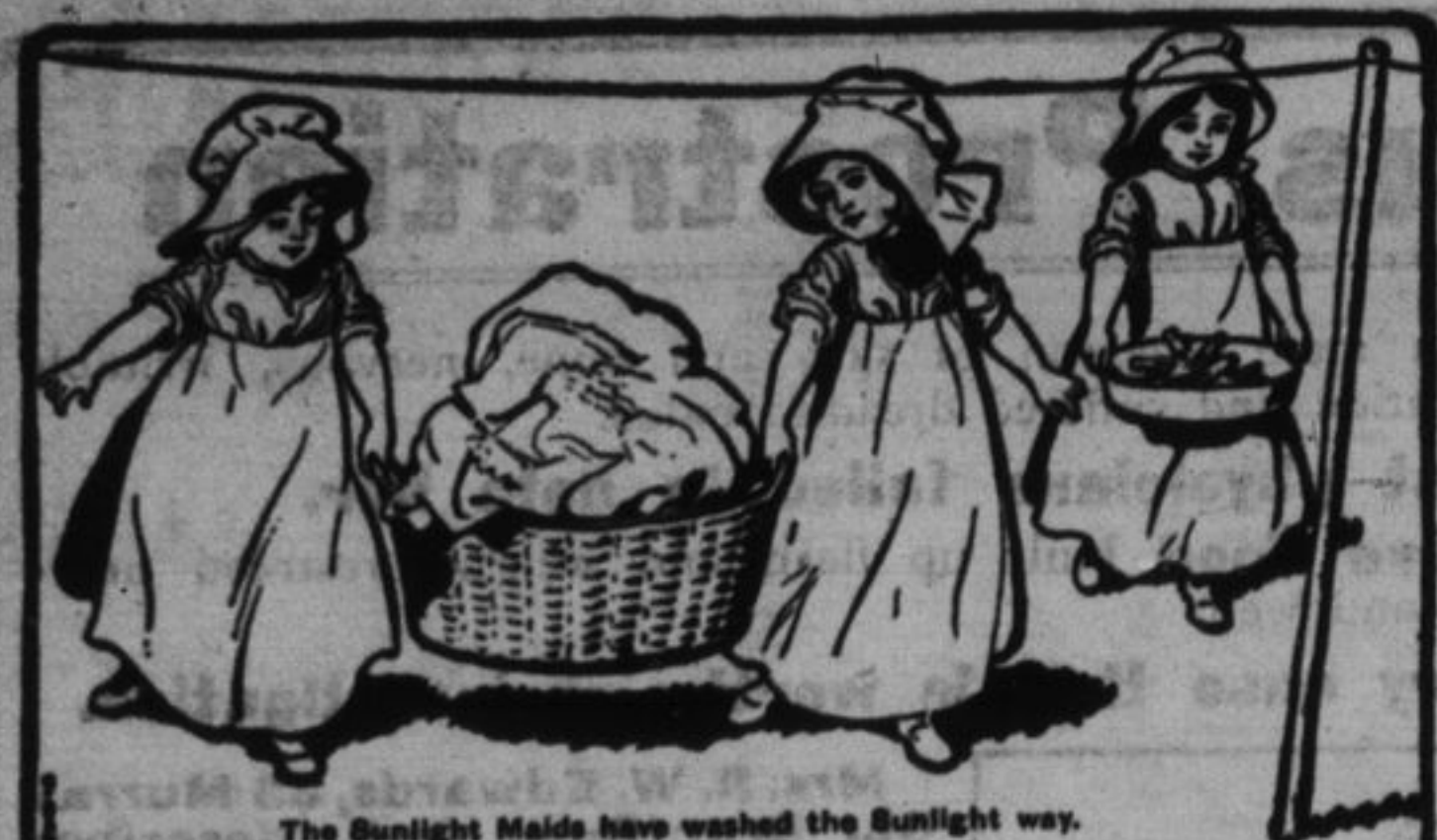
The Sunlight Maids have washed the Sunlight way.