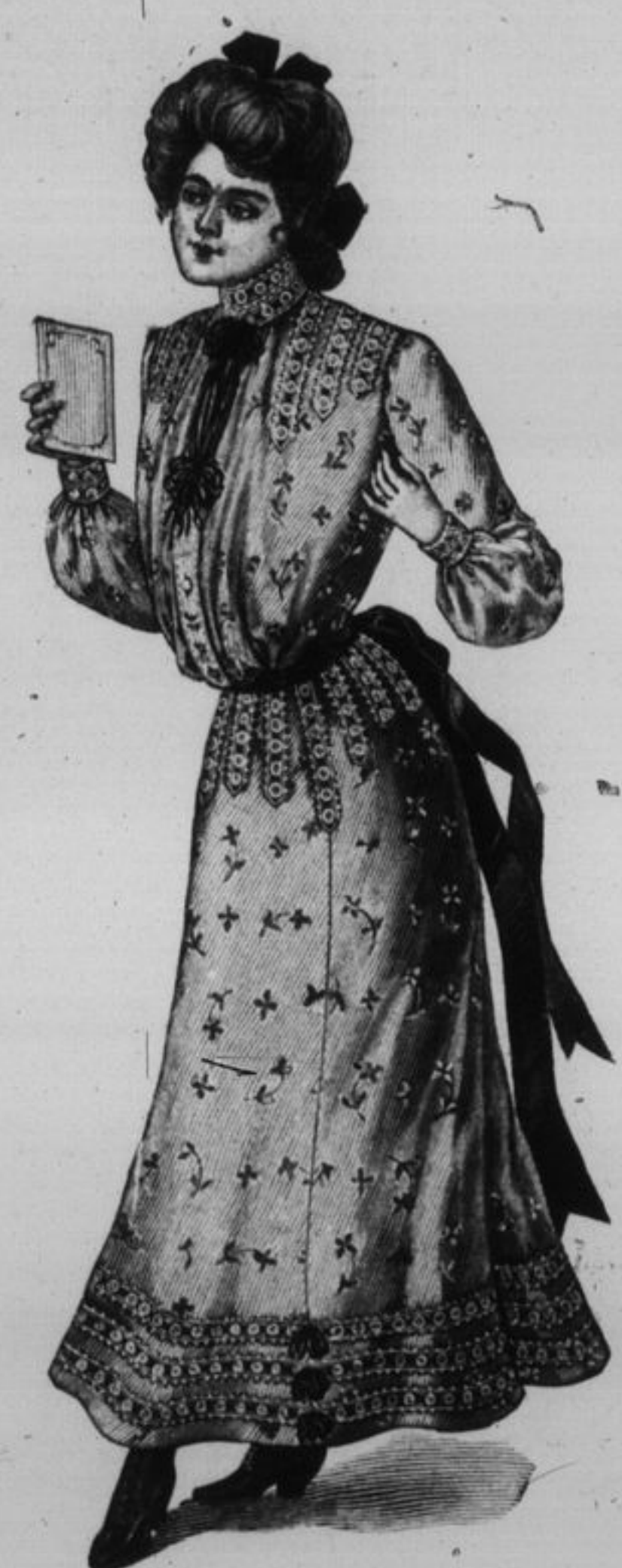
FIGURE 66 H.—MISSES' SHIRT-WAIST TOILETTE.

6593 - GIRLS' OR MISSES' SQUARE-YOKE DRESS, ½ to 9 years; 7 sizes. It requires ¾ yd. of goods 36 inches wide, with ¾ yd. of fancy tucking 18 inches wide, and 1 yard of edging 48 inches wide, for a child of 5 years. Price, 6d. or 15 cents. 6594 - GIRLS' OR MISSES' SQUARE-YOKE DRESS, ½ to 9 years; 7 sizes. It requires ¾ yd. of goods 36 inches wide, with ¾ yd. of fancy tucking 18 inches wide, and 1 yard of edging 48 inches wide, for a child of 5 years. Price, 6d. or 15 cents. 6595 - LADIES' CORSET COVERS AND DRAWERS IN ONE, Closed at the Front or Back, with Dutch Round, or Low Round or Square Neck, and with or without the Shield Sleeves, 20 to 46 inches bust; 9 sizes. It requires ¾ yd. of material 27 inches wide, for a lady of 34 inches bust measure. Price, 6d. or 20 cents.