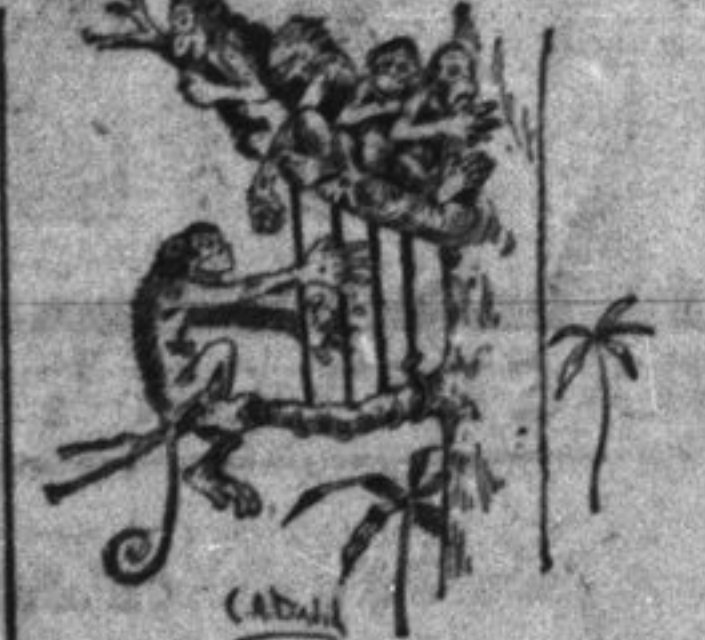
A Harp Concert in The Jungle.