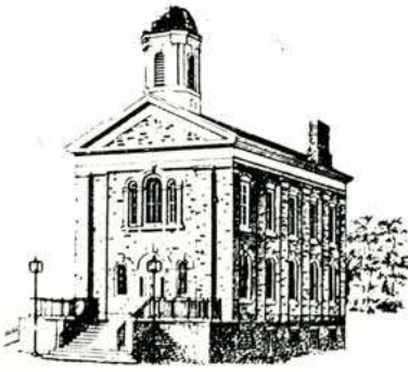
Former Town Hall Built 1857