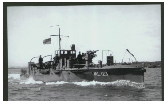
Elco manufactured motor launch (M.L. 123) east the North Sea.

The M.L.'s were wood-hulled and powered by two 440 hp gasoline engines enabling a top speed of 19 knots. Armament was a 13 pounder gun (soon replaced with a 3 pounder) forward and stern-mounted two depth charges. The M.L.'s, located off Southampton, would have covered wide sections of the English Channel as they had a range of up to 500, to 1,000 miles depending upon the speed and hence fuel consumption. The patrol areas could extend from the entrance to the Channel off Land's End, Cornwall, to past Dover-Calais as far