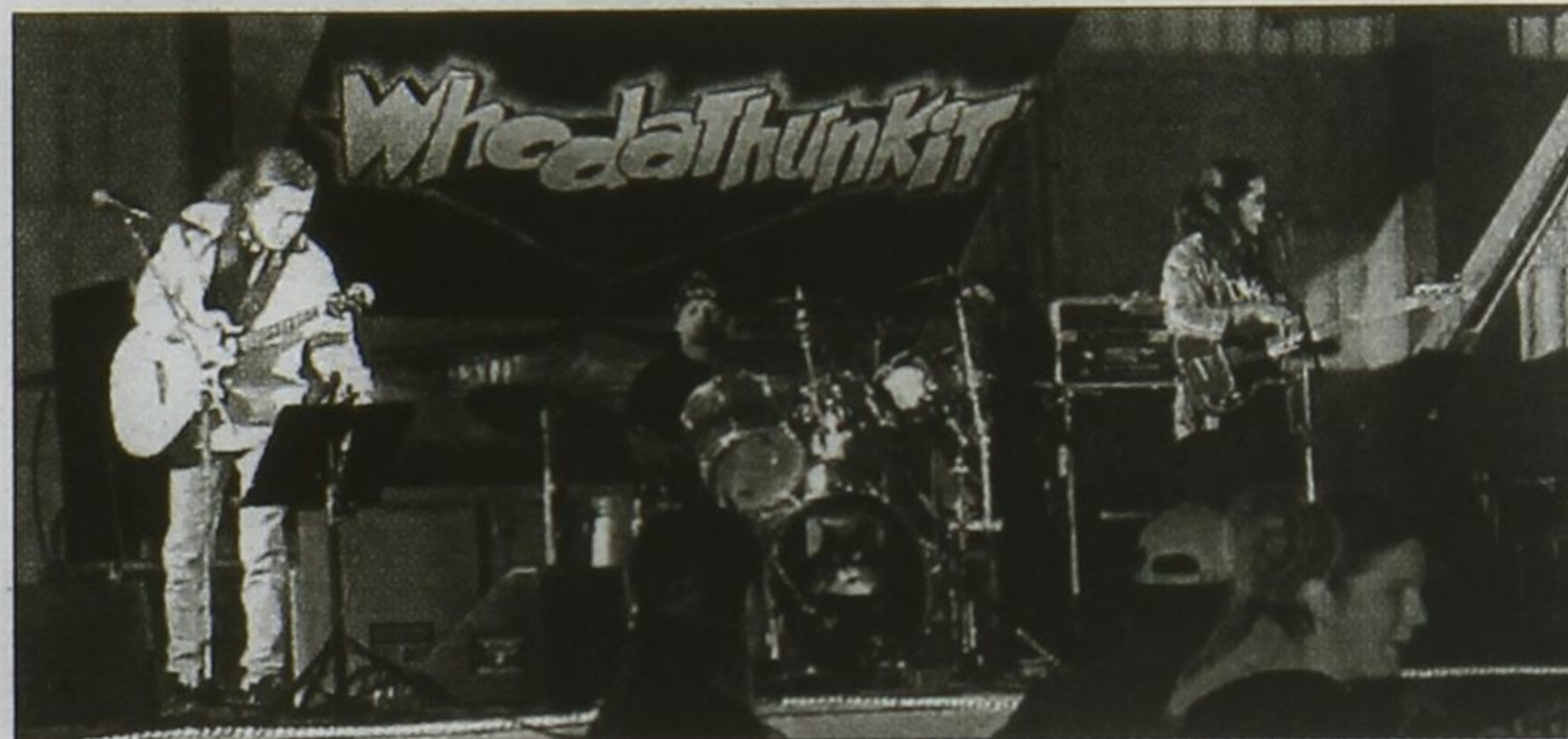
Whodathunkit tunes up for a night to remember Nov. 7 at Luke's Bid and Bop, which took place at Markham Fairgrounds. Close to 700 people showed up to dance the night away, bid on fabulous auction items and chow down on a delicious buffet.