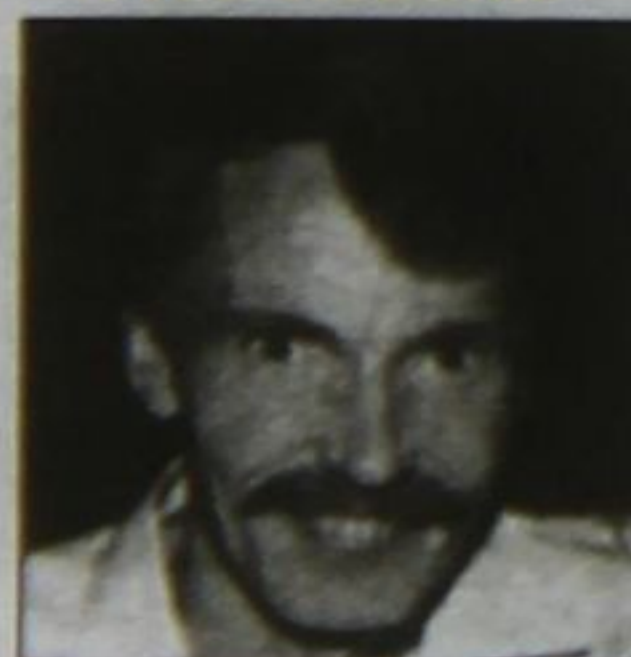
Candidate - Ward 4