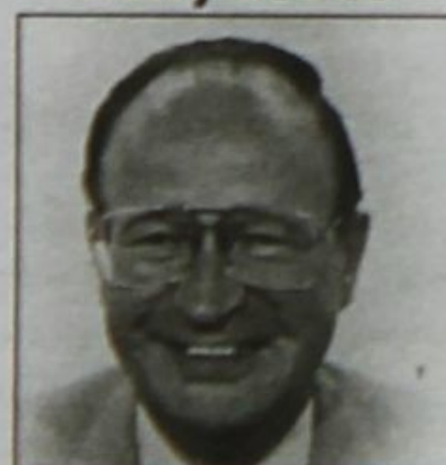
Candidate - Ward 5