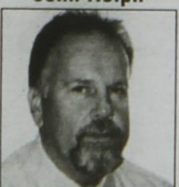
Candidate - Ward 5