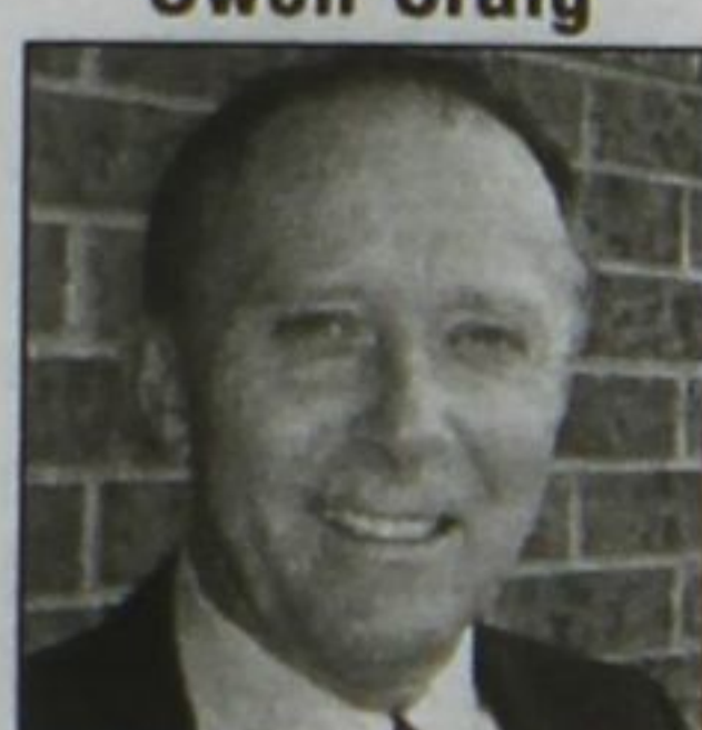
Candidate - Ward 6