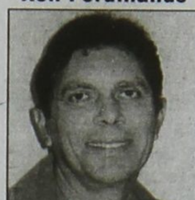
Councillor - Ward 1