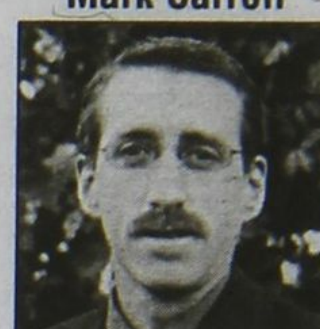
Candidate - Ward 2