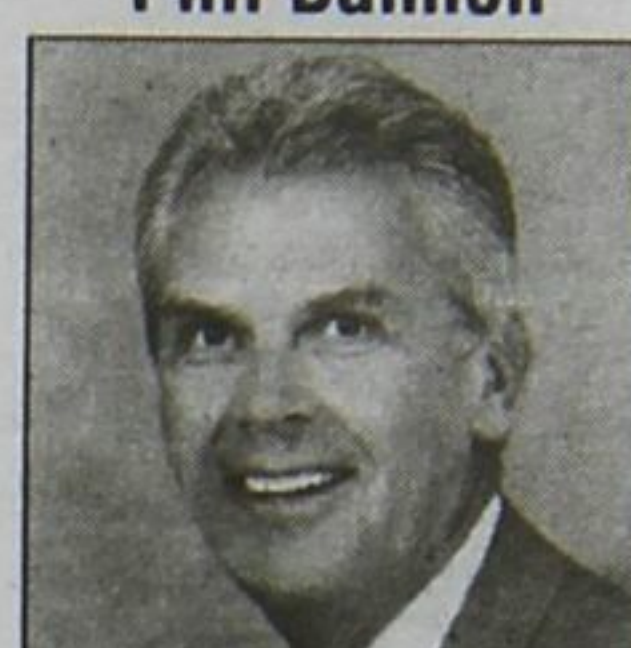
Candidate - Ward 2