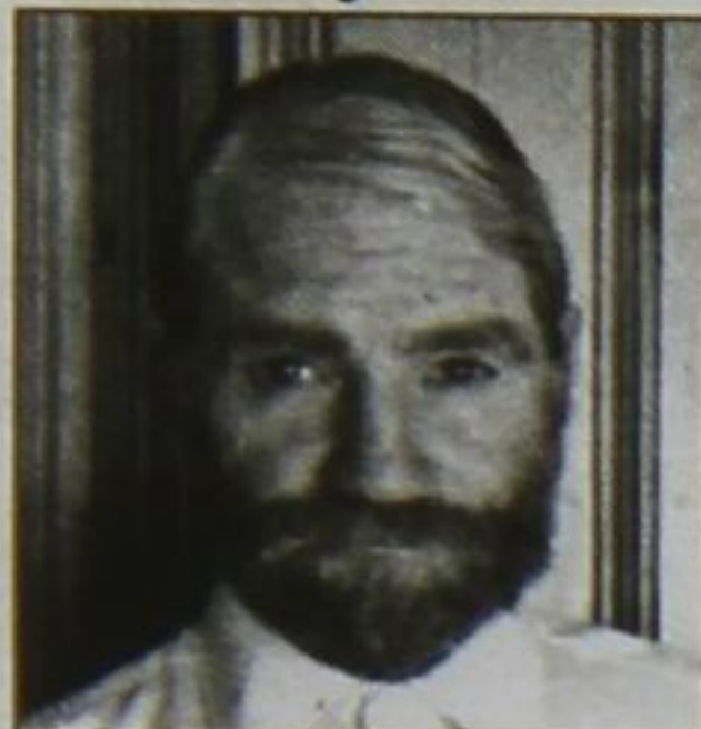
Candidate - Mayor