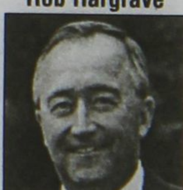
Candidate - Ward 6