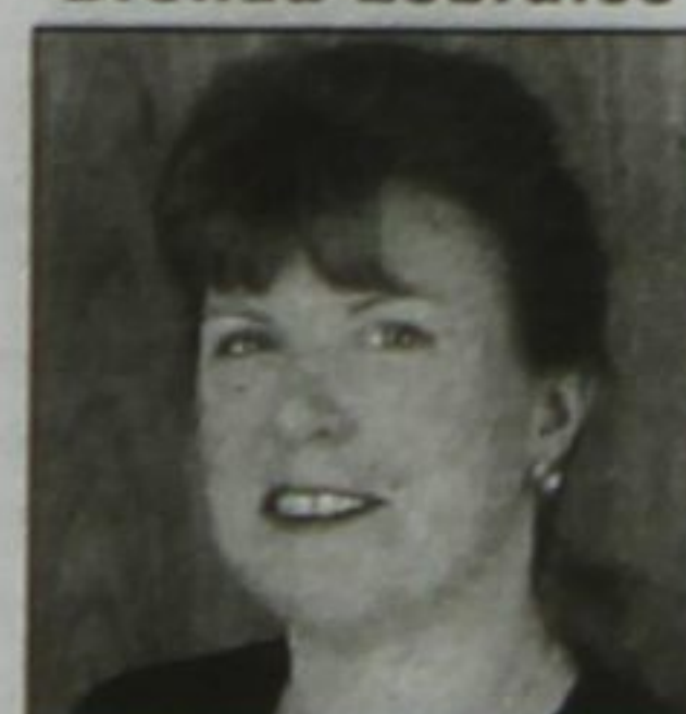
Candidate - Ward 5