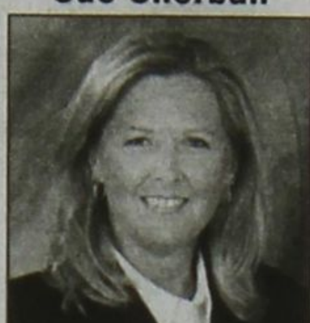
Candidate - Mayor