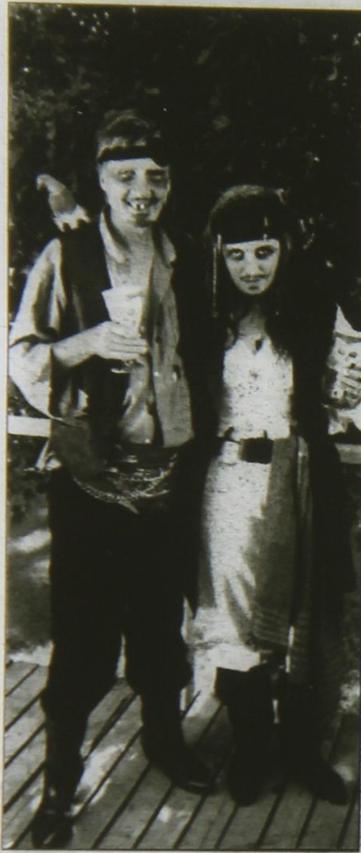
Long John Silver, before he became partially legless, poses with a fierce-looking pirate pal, while his ever-present companion, the enigmatic parrot, surveys the party scene.

theme was piratical, and everyone got into the spirit of things, with no reports of dissenters being made to walk the plank.