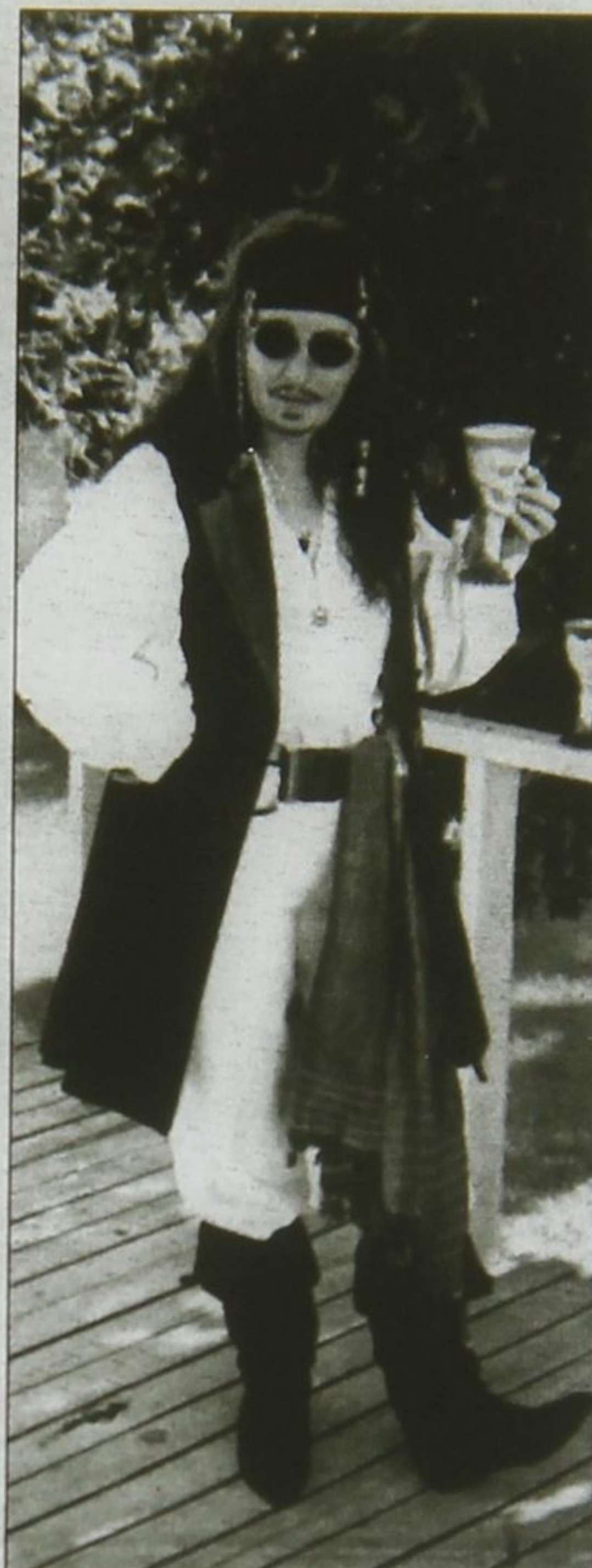
Step aside, Johnny Depp. This pirate takes a swig from a deadly-looking chalice in a swashbuckling manner guaranteed to outdo the Pirates of the Caribbean star.