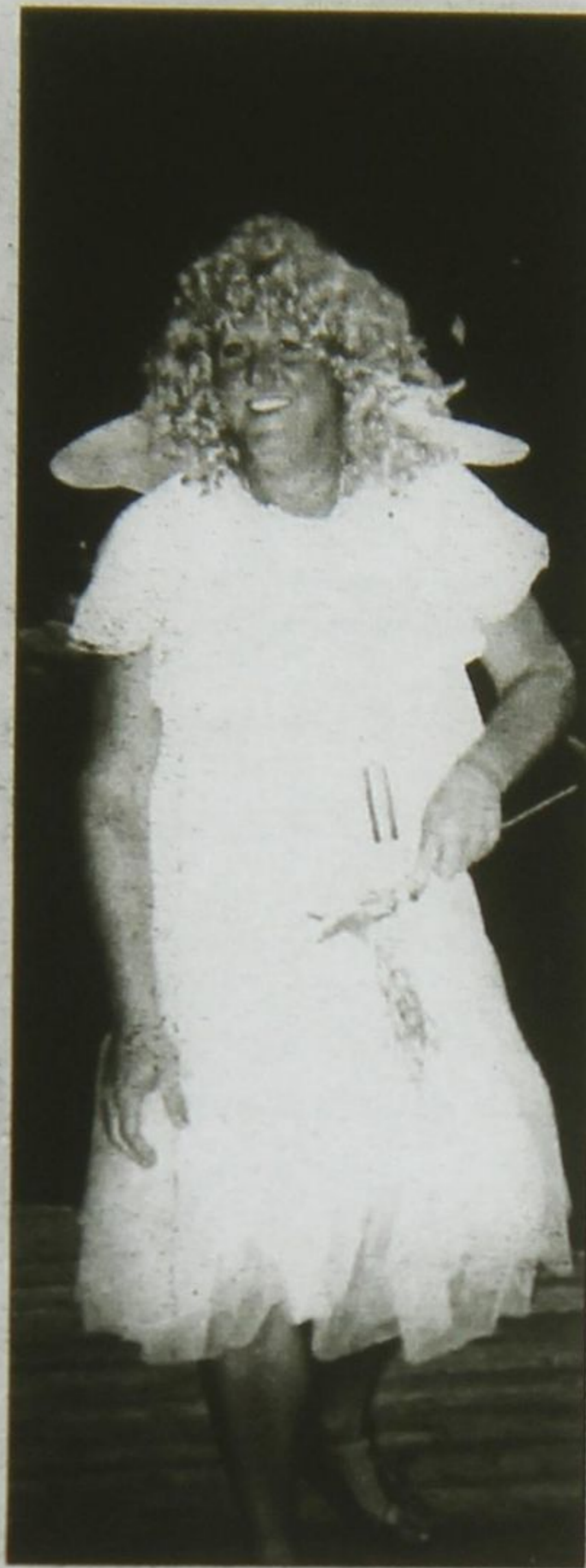
Is it a fairy I see before me? This burly, golden-ringletted beauty dropped by to lend some heft to a rather lightweight costume at this summer's Bouwmeister Bash.