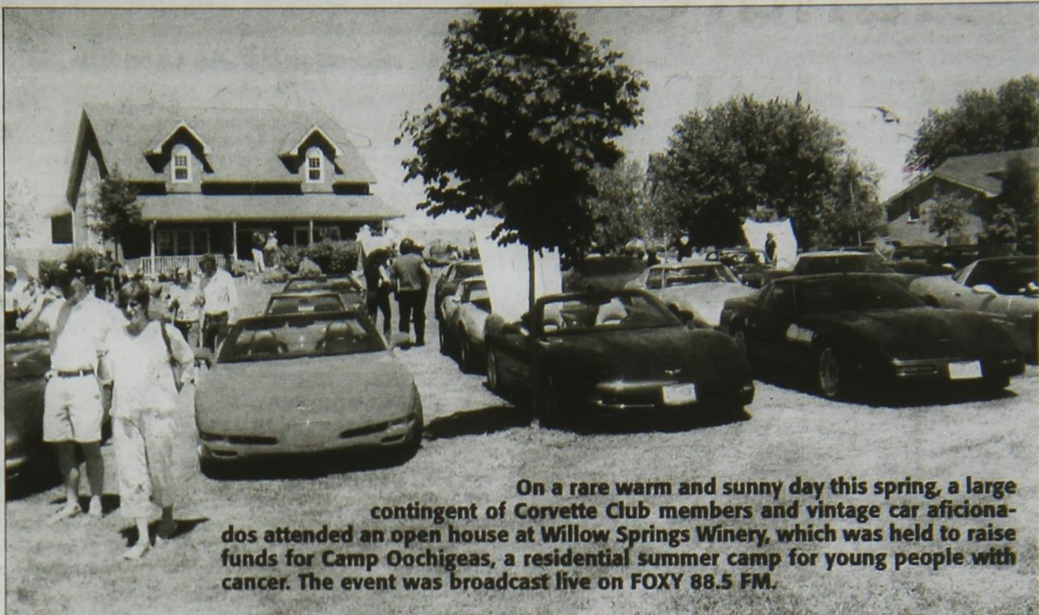
On a rare warm and sunny day this spring, a large contingent of Corvette Club members and vintage car aficionados attended an open house at Willow Springs Winery, which was held to raise funds for Camp Oochigeas, a residential summer camp for young people with cancer. The event was broadcast live on FOXY 88.5 FM.