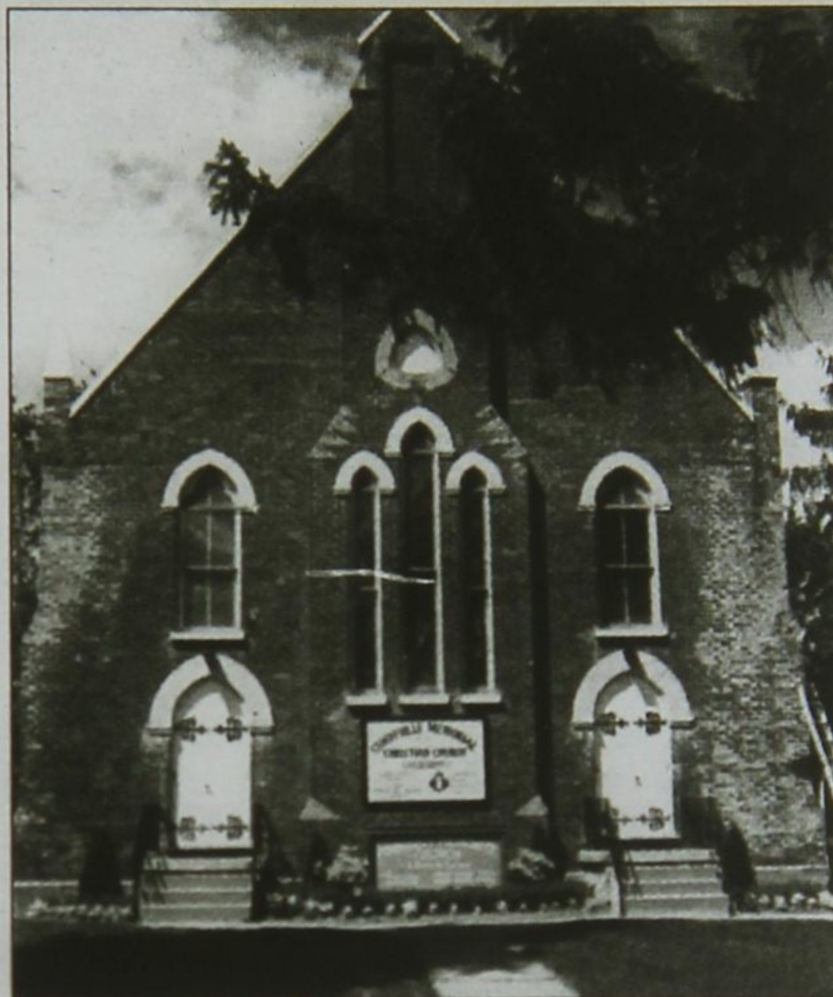
STOUFFVILLE MEMORIAL CHRISTIAN CHURCH

New Patients Welcome - Evening Appointments Available