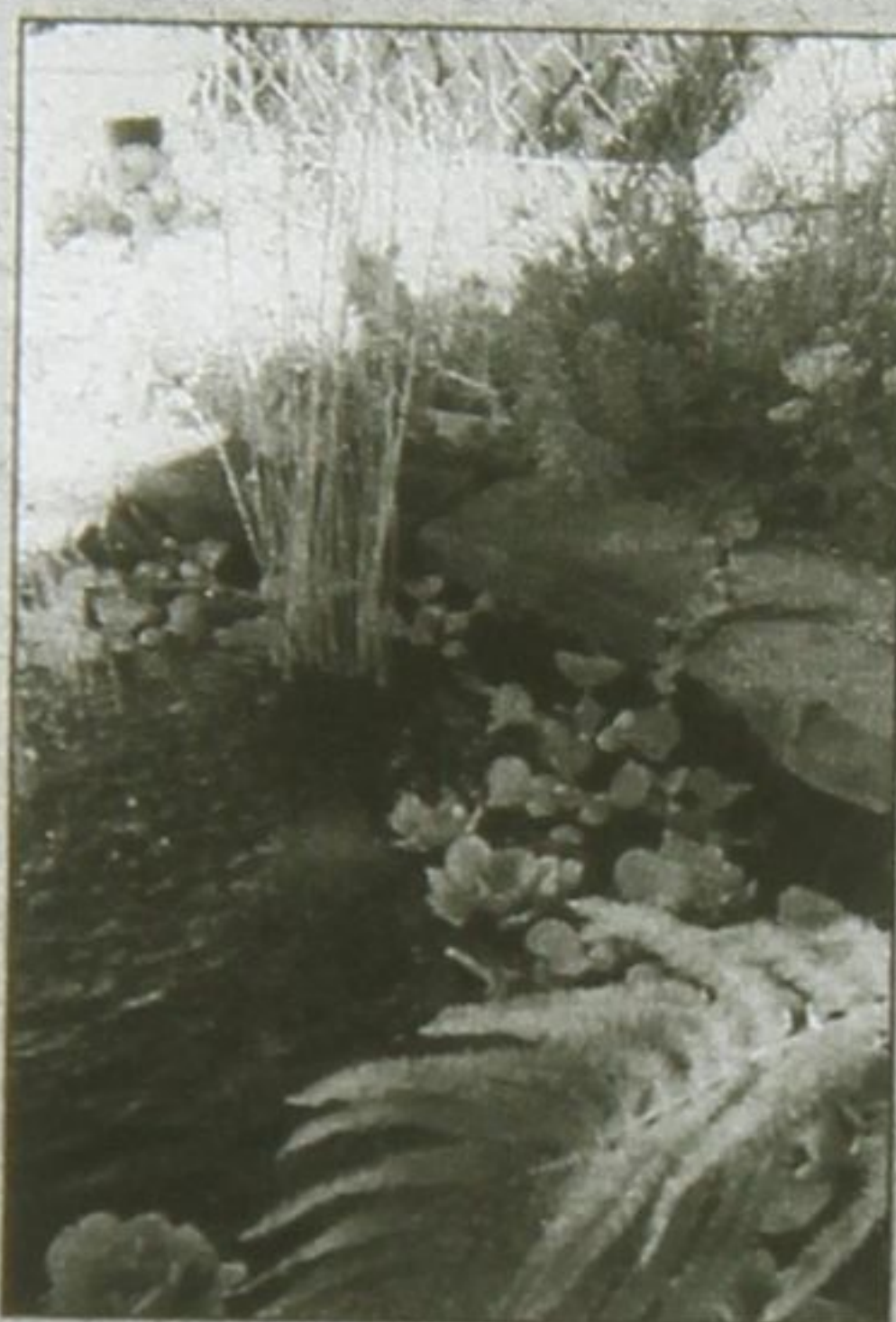
A pond is very easy to install and adds a dash of magic to your landscape.

The great thing about these ponds is that they don't require acres of land. Even tiny urban lots can accommodate them; all you need is a few square feet to spare. To choose the right location, take the overall layout of the yard into account and be sure there is ample room for children to play.