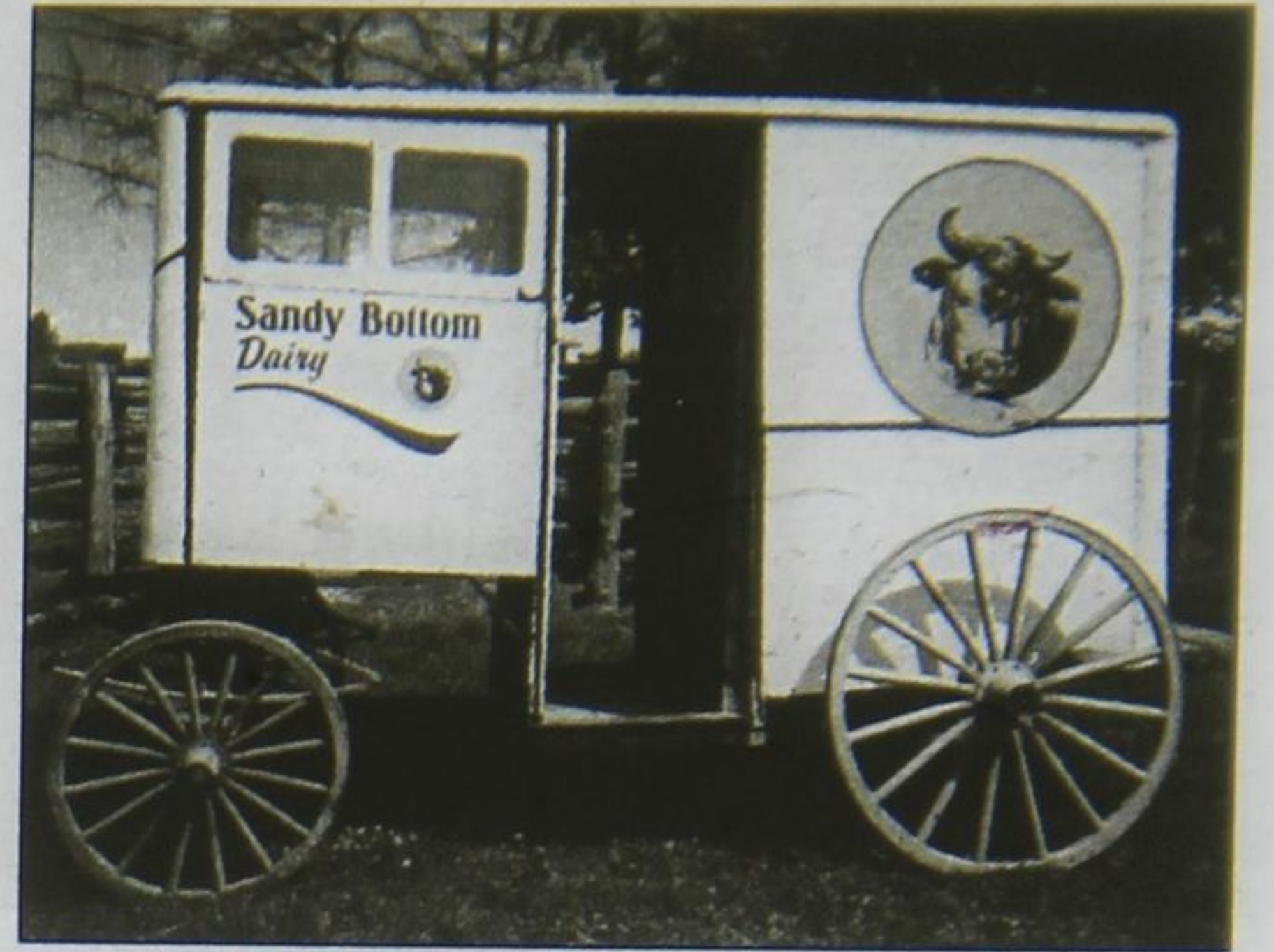
Lionel's Farm covered dairy wagon