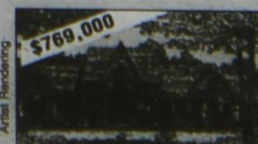
Country Romance, Bungalow, Lot 9