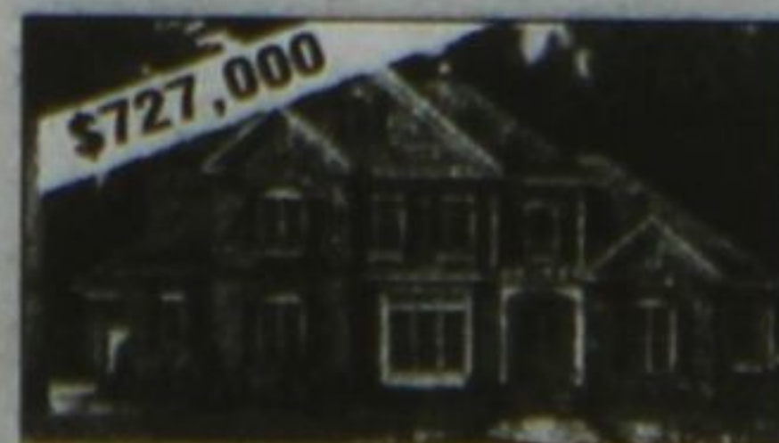
Country Romance, 2-Storey, Lot 10