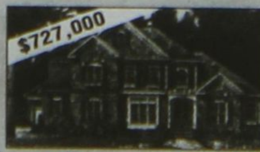
Country Romance, 2-Storey, Lot 10