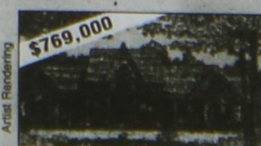
Country Romance, Bungalow, Lot 9