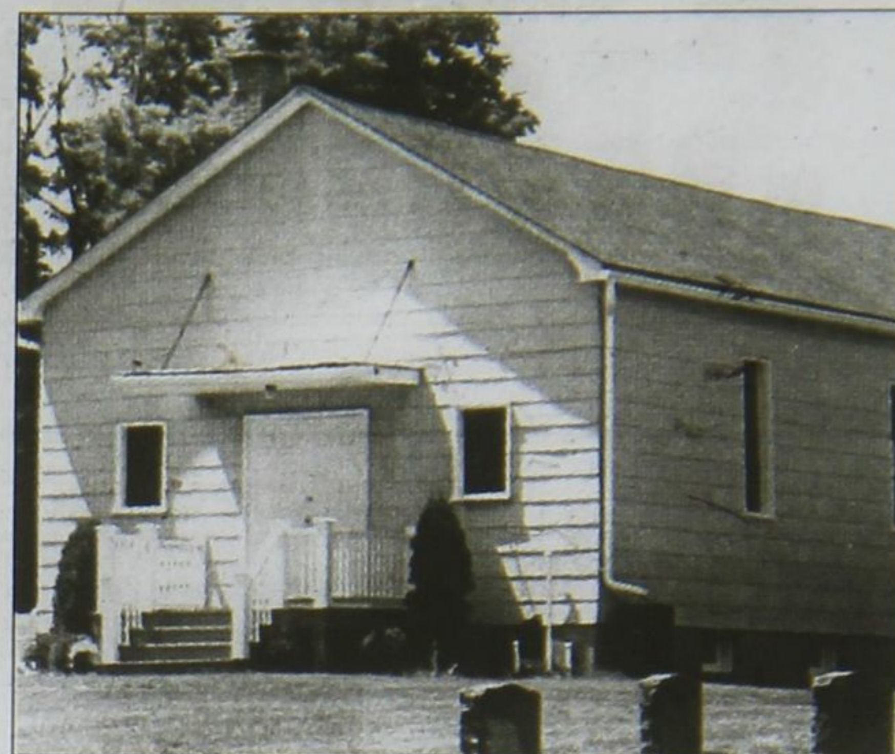
Pine Orchard Meeting House