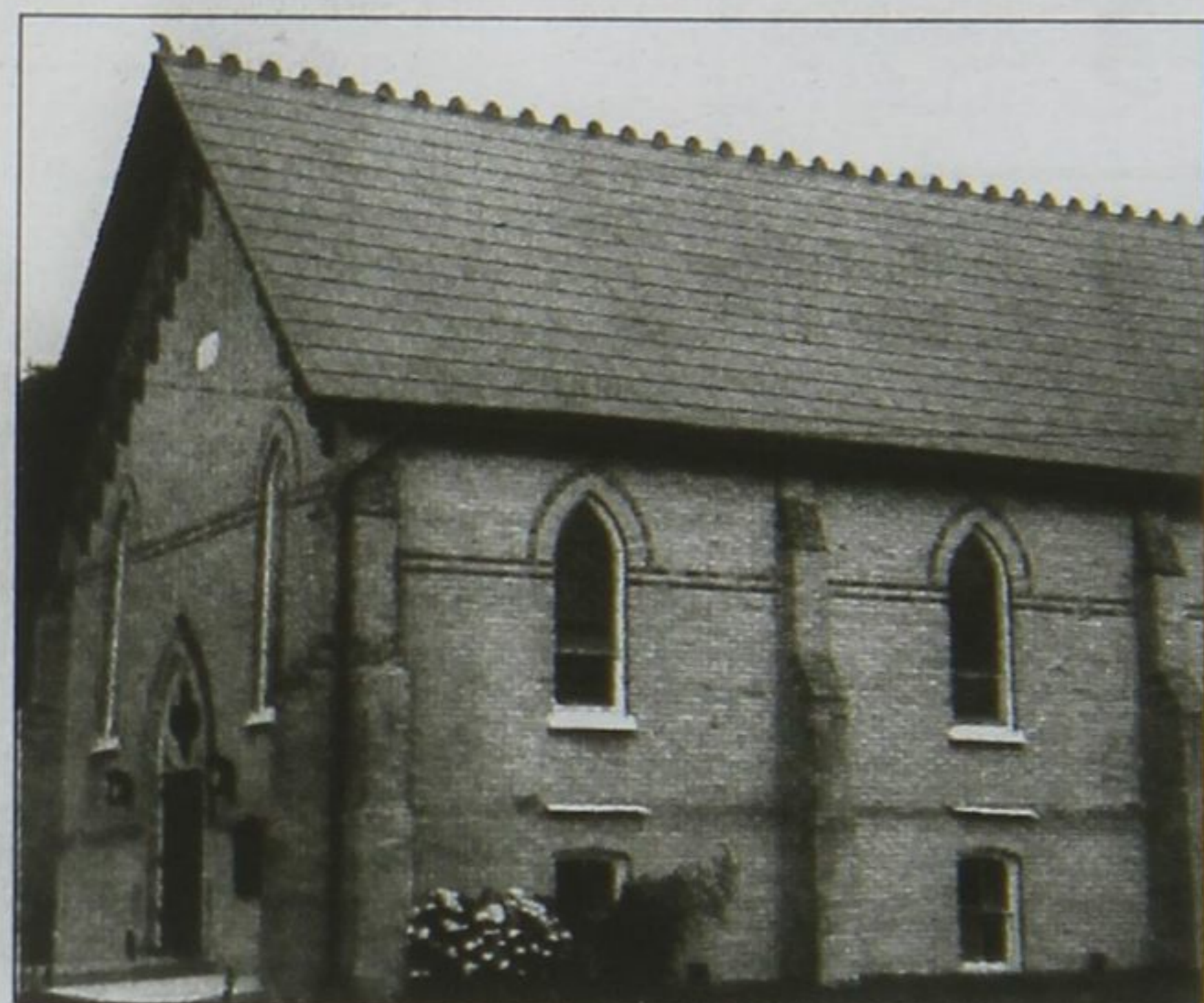
Wesley United Church