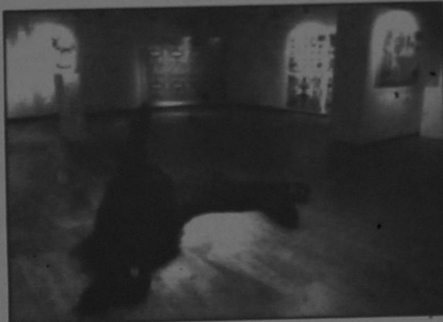
This giant hare is featured in The Latcham Gallery's current exhibition, Fruits of Labour .