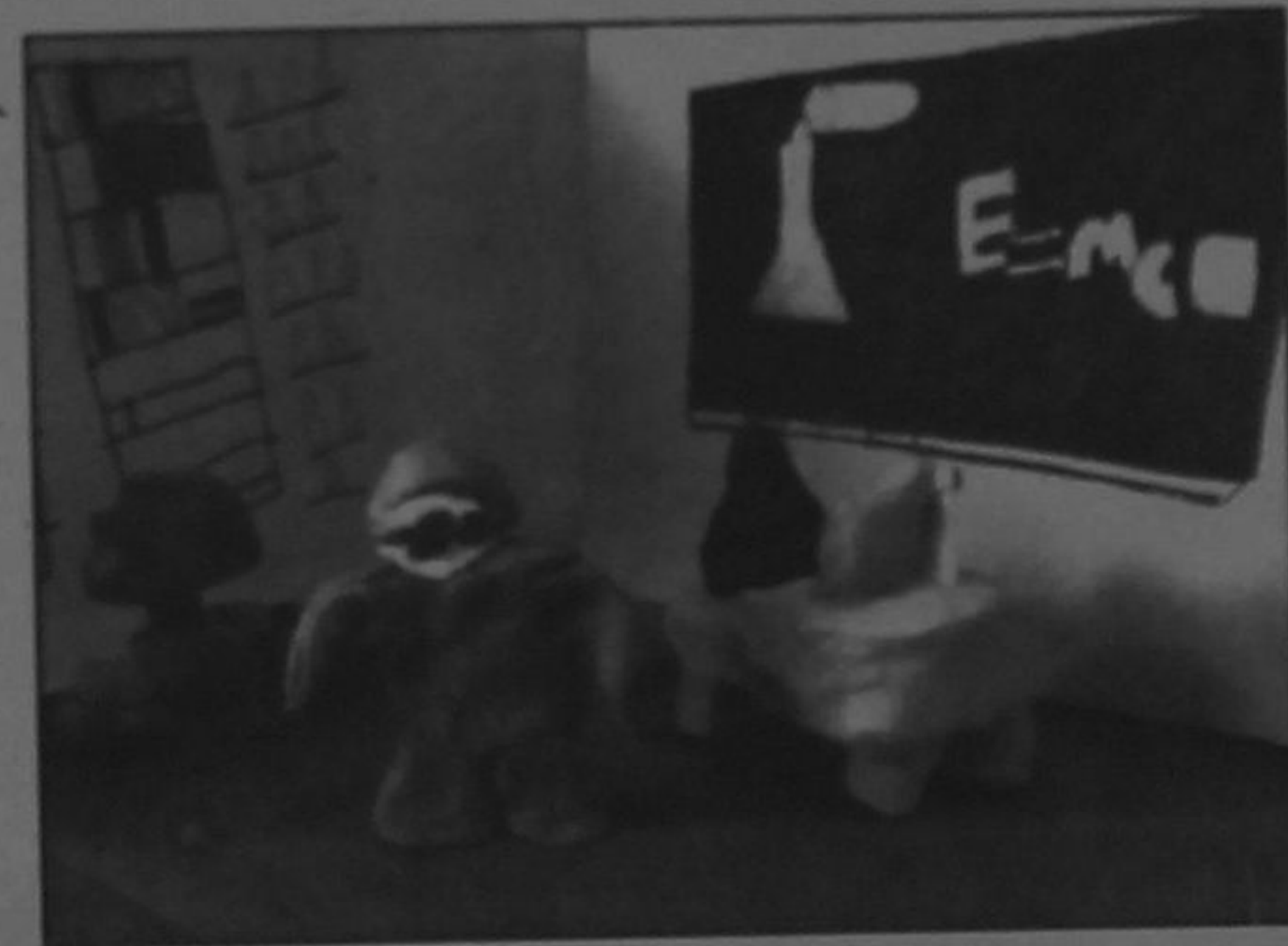
The Latcham Gallery's Stop-Motion Animation Studio for students aged 8 and up begins Jan. 14.