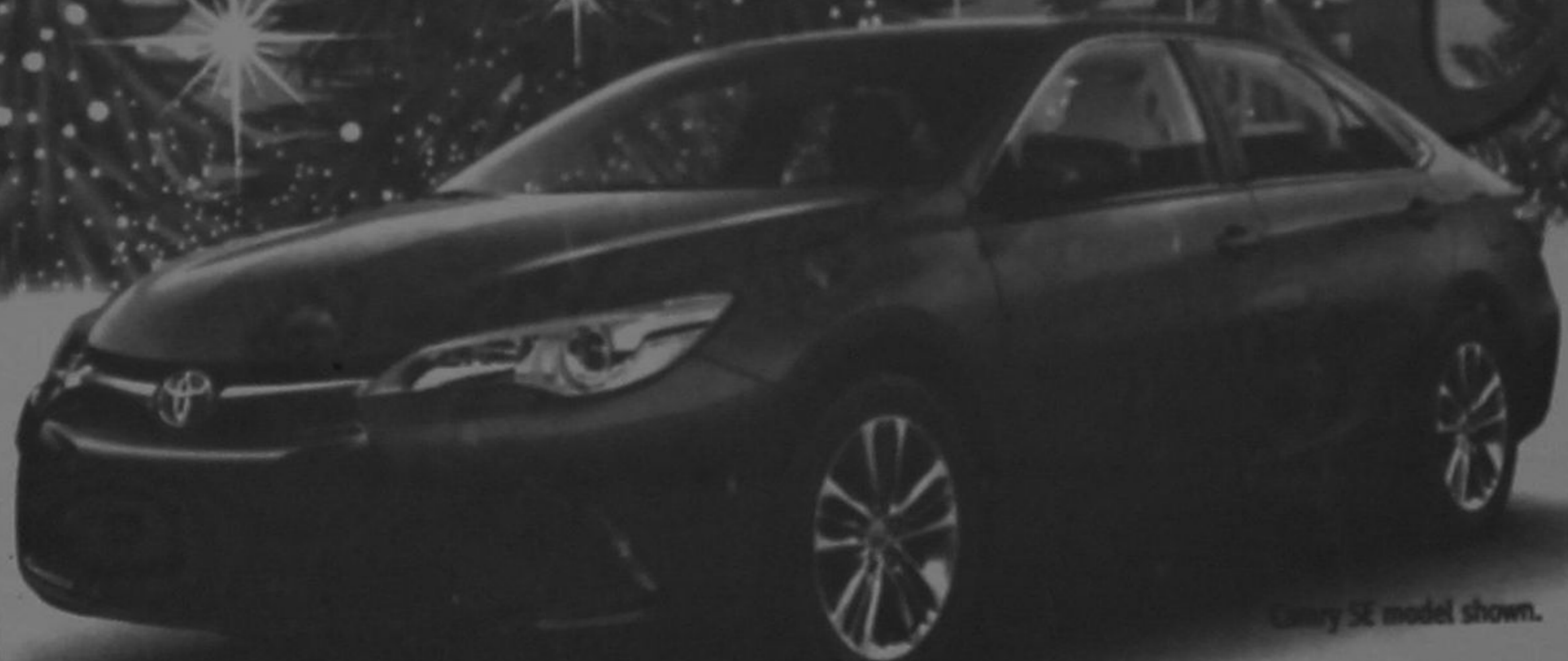
Camry SE model shown.

...and see why it is the BEST selling new vehicle!