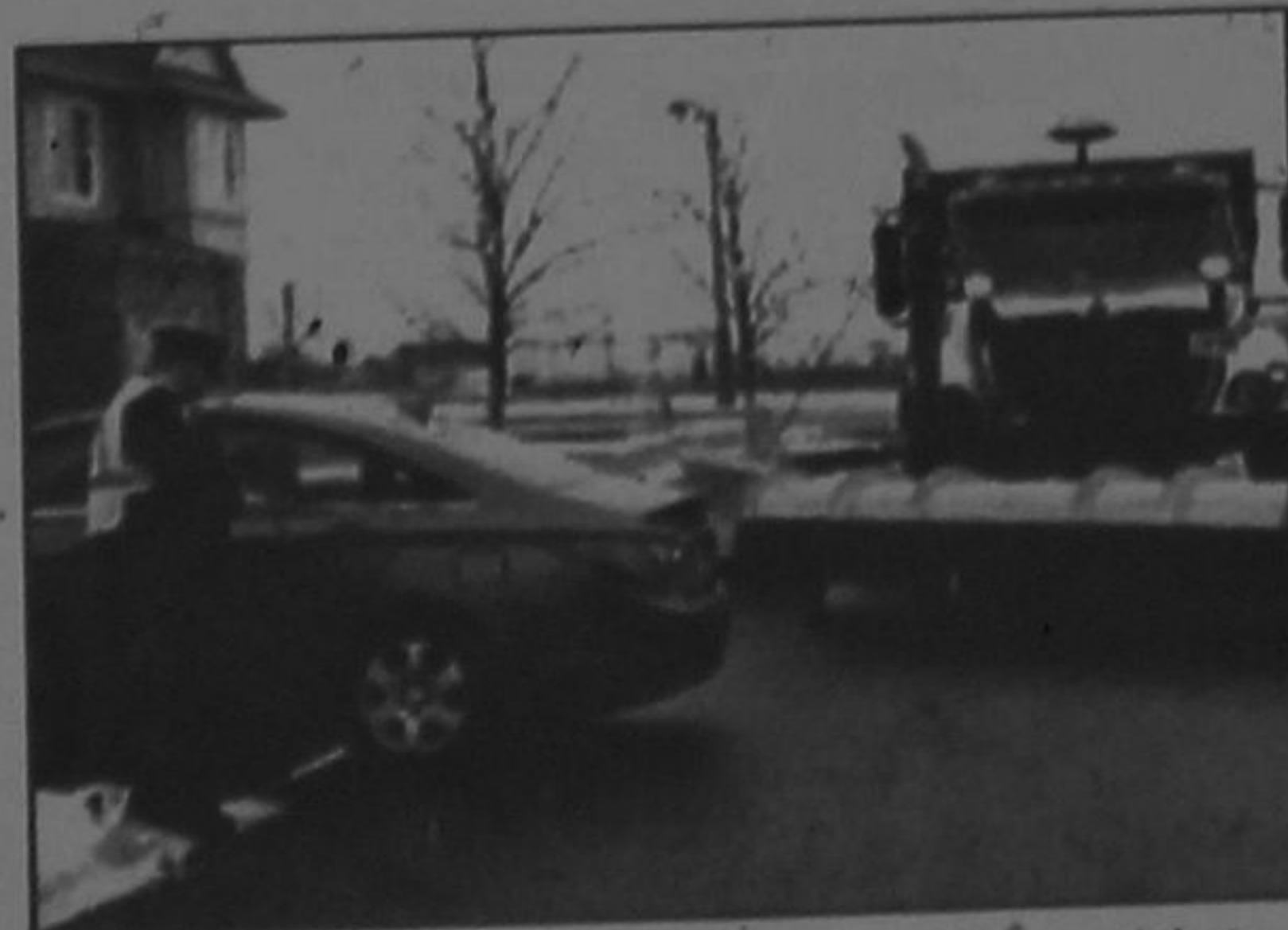
Do not park your vehicle this way. You will get a ticket.