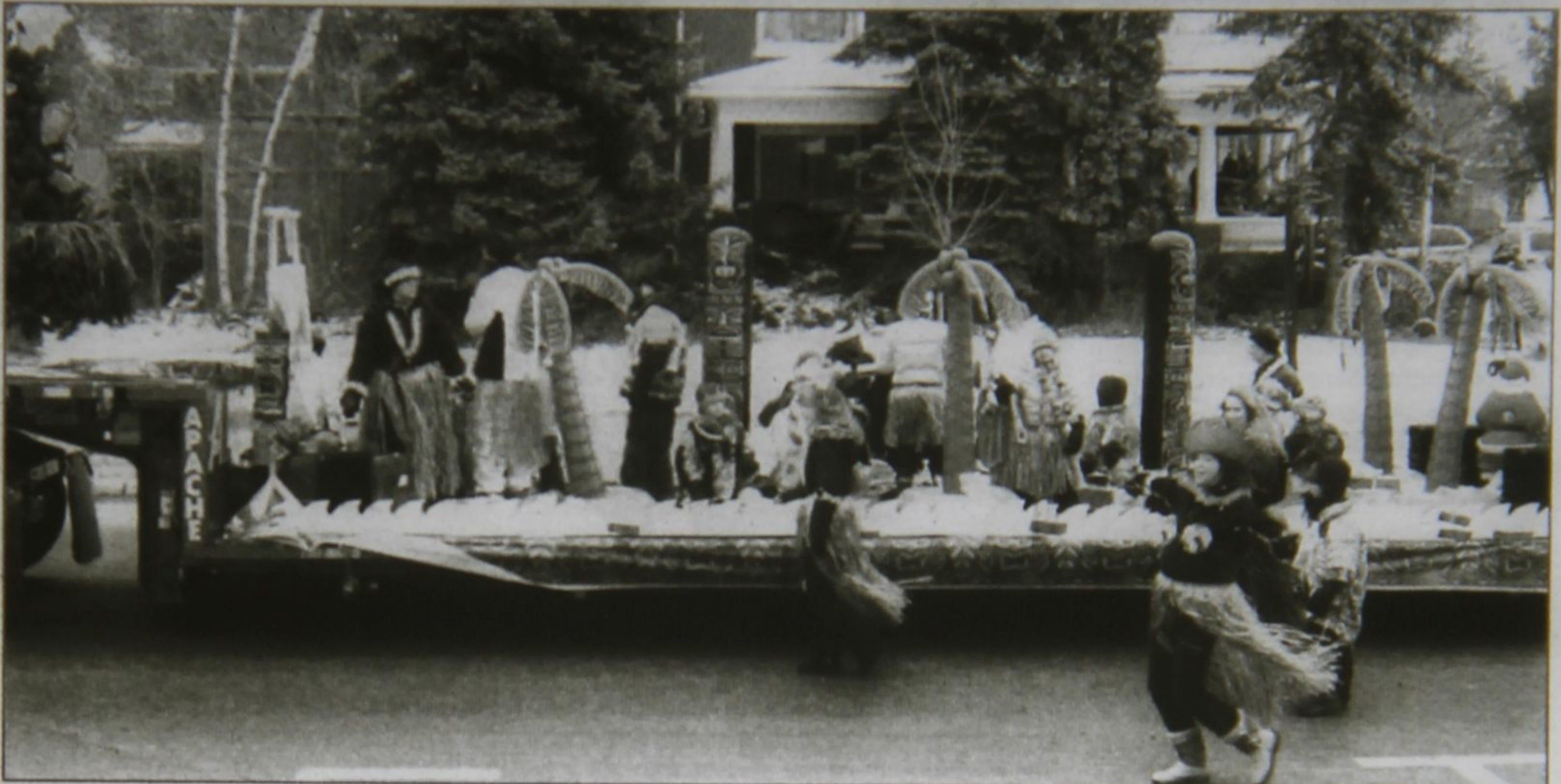
A tropical Christmas: It may have been cold and snowy outside, but Scotiabank brought some welcome island sunshine into the Kinsmen's Santa Claus Parade, with palm trees, grass skirts and some lively island music.