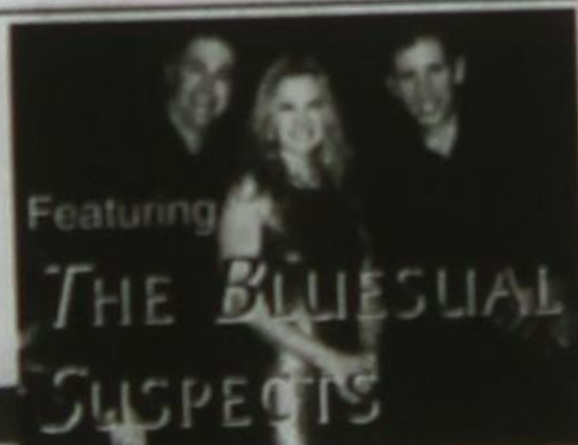
Featuring THE BLUESUAL SUSPECTS