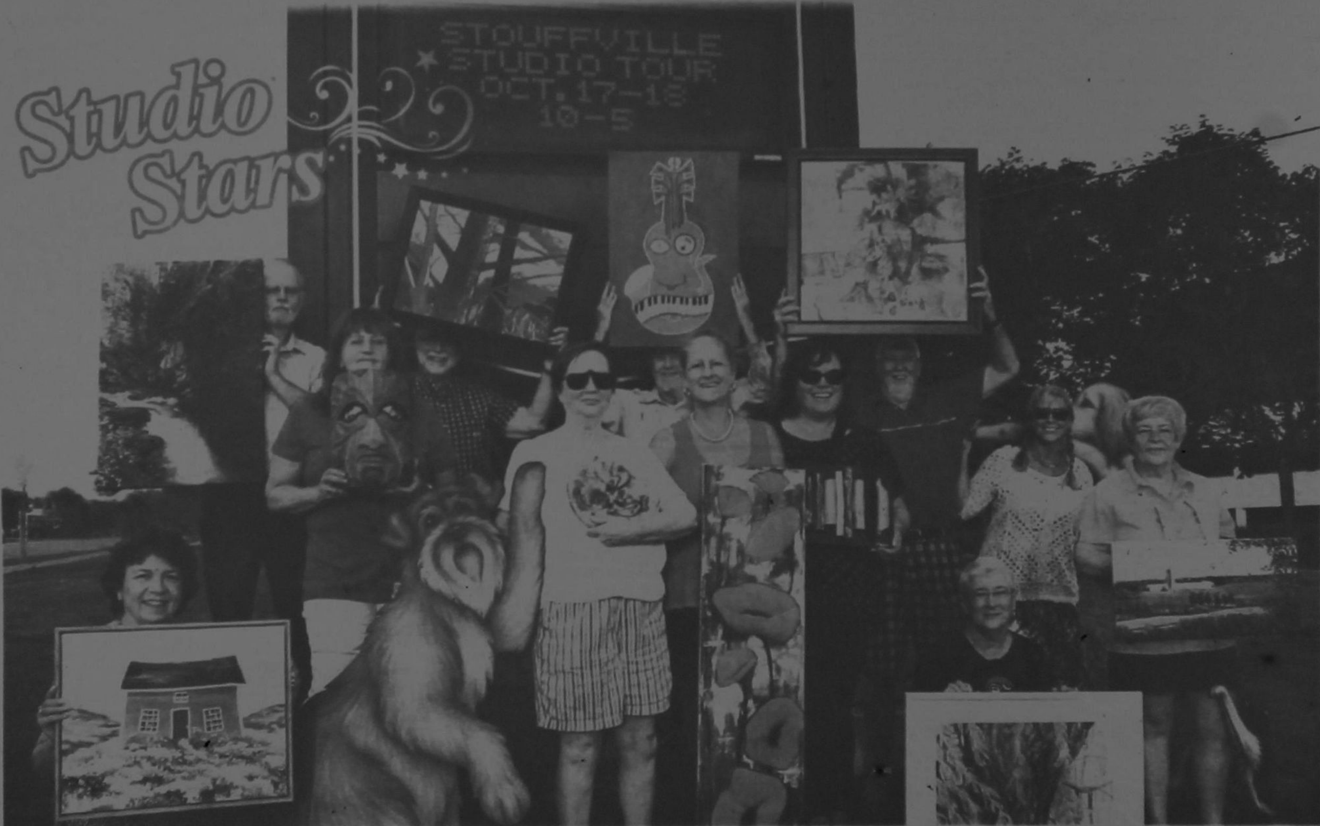
Thirty one artists including the 12 pictured above will set up their creations in 20 locations across Town for the 15th Annual Whitchurch-Stouffville Studio Tour and Sale the weekend of October 17-18. The works shown here are a small sampling of the wood sculptures, oils and water colour paintings, porcelain and glass jewellery, totems, masks and other unique works that will be on display. See story on page 10.

October 2015 • Vol. 10, No. 11 • stouffville.com