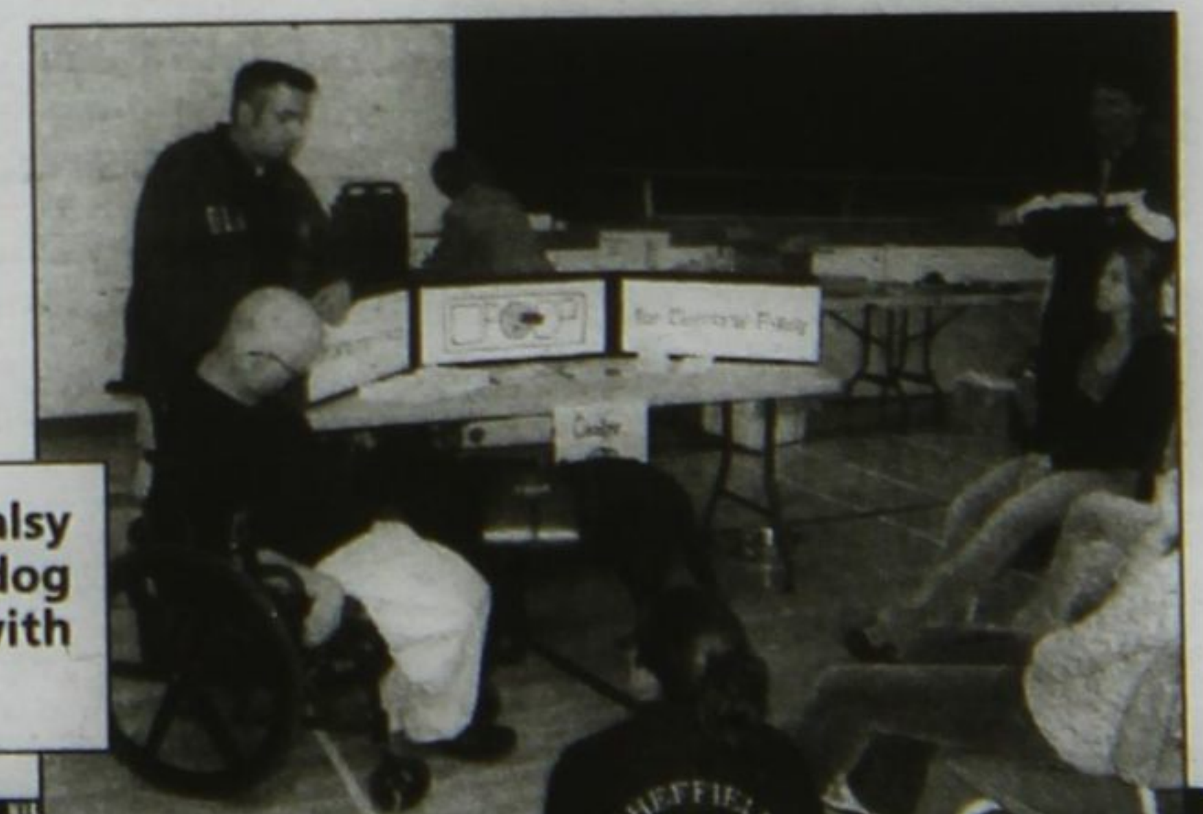
A man with cerebral palsy shows how his guide dog helps him cope with everyday needs

The goal of the Accessibility for Ontarians with Disabilities Act, which became law on June 13, 2005, is to provide a barrier-free Ontario by 2025, and the Whitchurch-Stouffville Accessibility Committee advises the town on specific local requirements that will help to meet that goal.