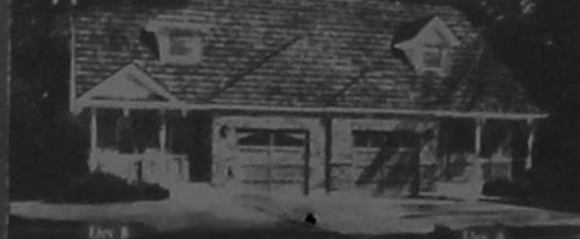
The Stacy House - 1,790/1,585 Sq. Ft.