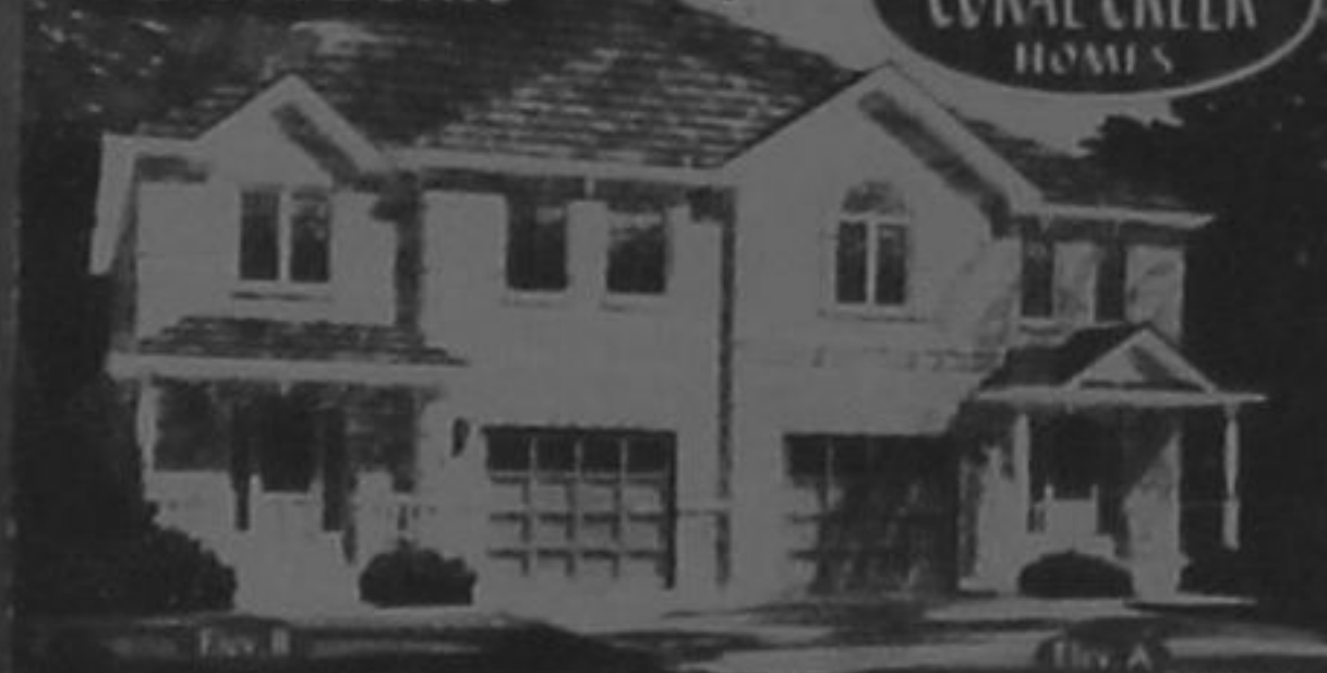
The Gilbert House - 2,277 Sq. Ft.