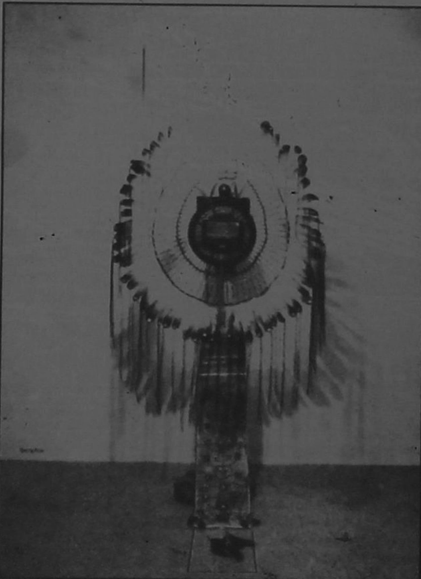
Urban Bustle 2014 is a mixed media assemblage by Barry Ace. The artist's solo exhibition, Mnemonic Manifestations, opens July 9 at The Latcham Gallery.