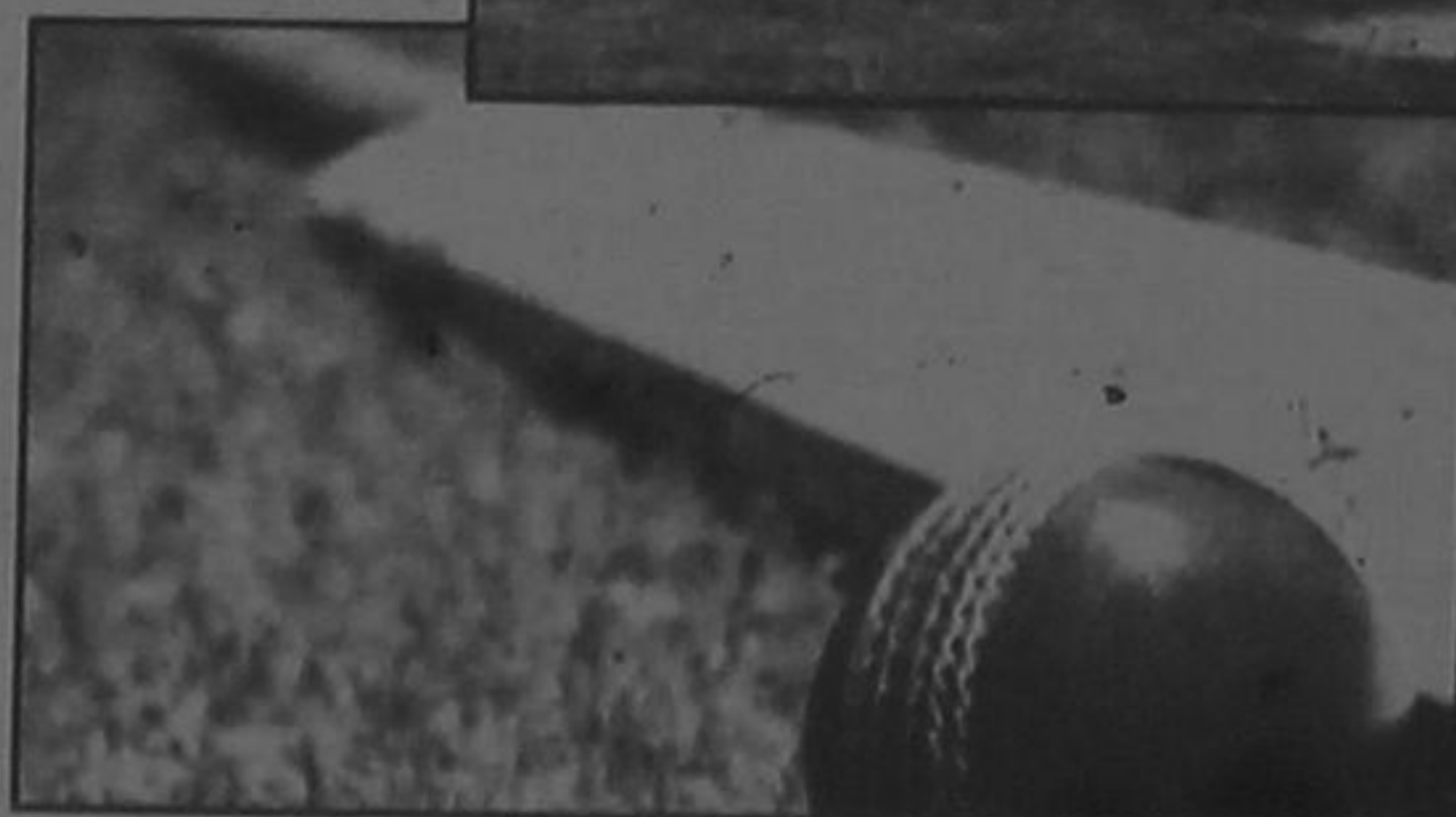
Members of the Stouffville Cricket Club prepare for the 2015 season at Bethesda Park.