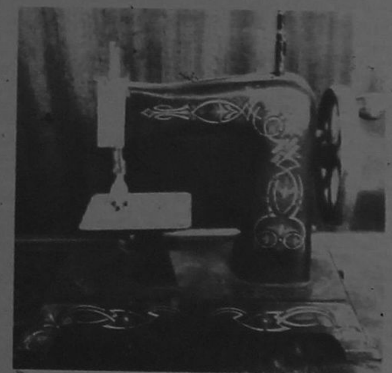
Child's Sewing Machine

With more to explore at Reid's you never know what you will find, from antiques, books, collectibles & ever-changing eclectic items. We are always pleased to buy or consign your quality items.