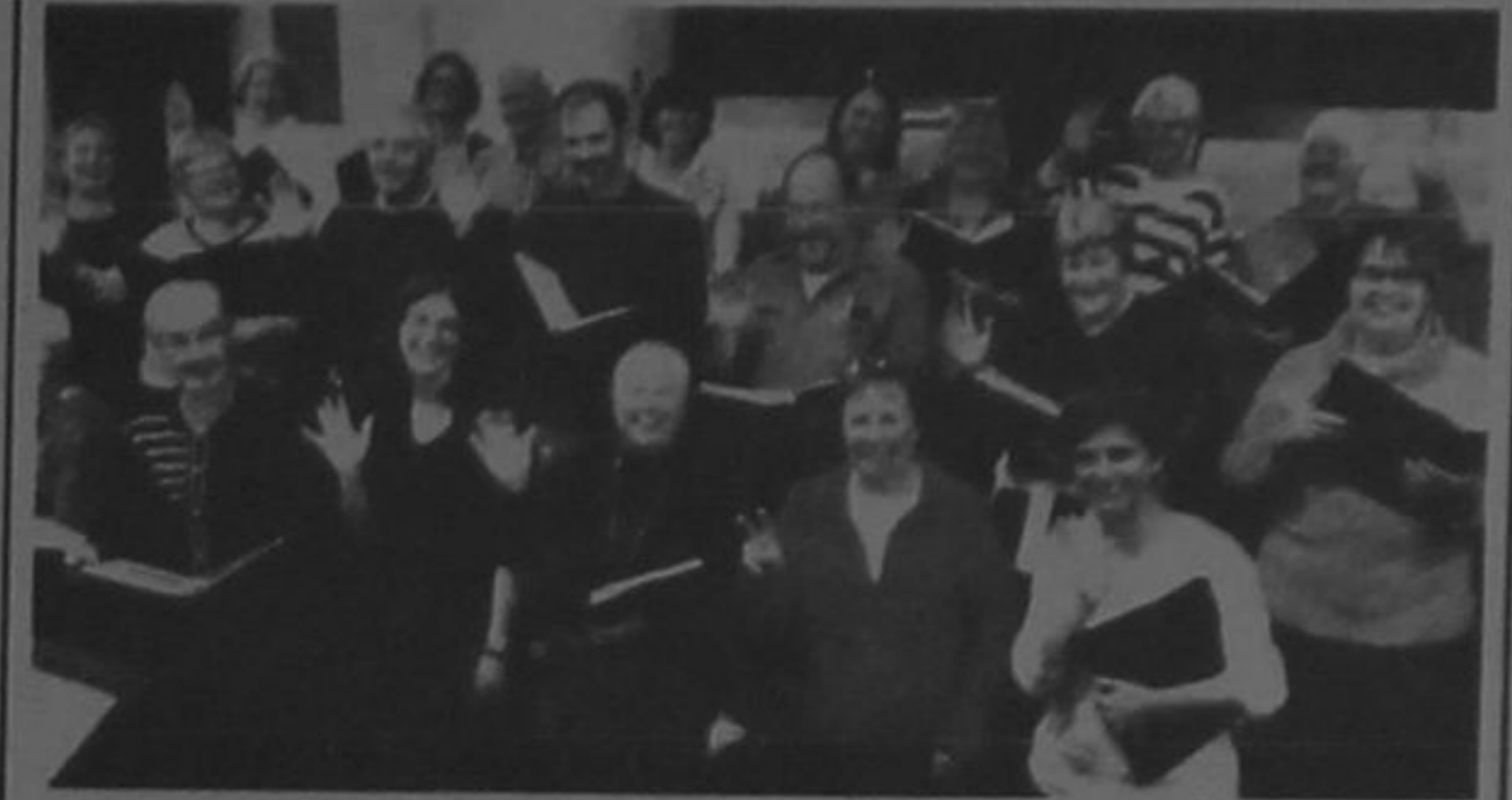
Bach to Blues goes Back to the Sixties on May 2 at Christ Church Anglican.

On May 2, Stouffville's Bach to Blues Company invites you to join them on their musical journey Back to the Sixties at Christ Church Anglican on Sunset Blvd.