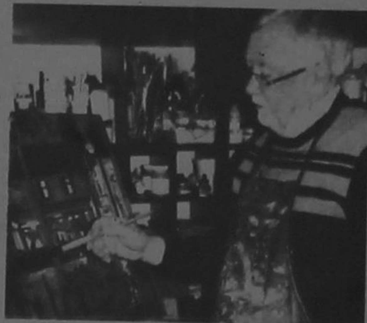
31 juried artists and artisans