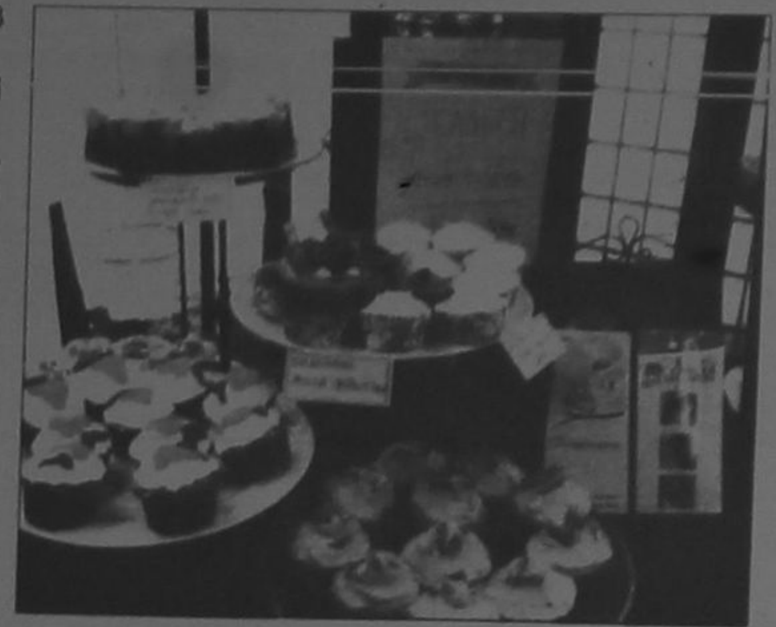
The staff at Stouffville Florist baked these yummy cupcakes in support of the Cancer Recovery Foundation.

The Cancer Recovery Foundation helps families and patients during the recovery stages of cancer, both financially and through healing help. The charity can be reached through their website at www.cancerrecovery.ca or by phone at 905-477-7743.