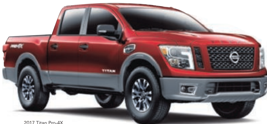
2017 Titan Pro-4X model shown*