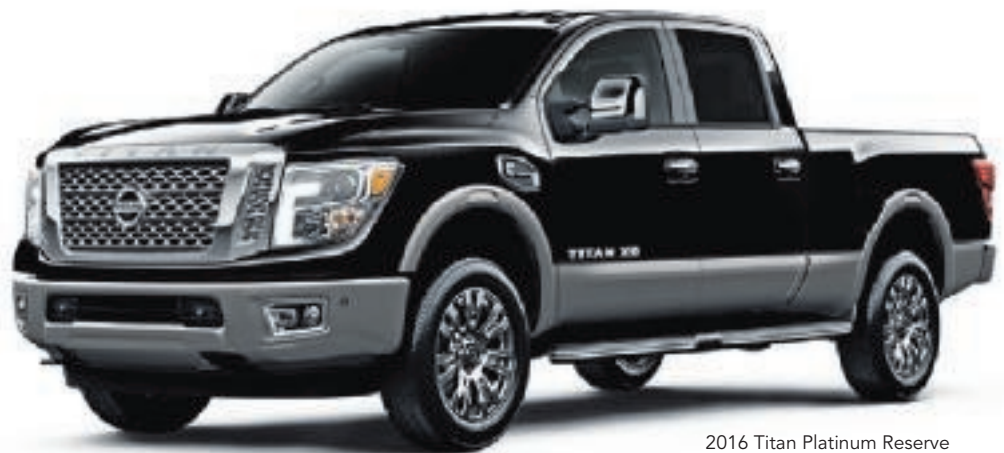
2016 Titan Platinum Reserve model shown*

TOTAL STANDARD RATE FINANCE INCENTIVES INCLUDES $1,000 AFTER TAX LOYALTY/CONQUEST INCENTIVE ON REMAINING 2016 TITAN XD DIESEL PLATINUM RESERVE