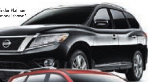
2017 Pathfinder Platinum model shown*