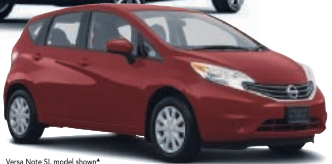
Versa Note SL model shown*