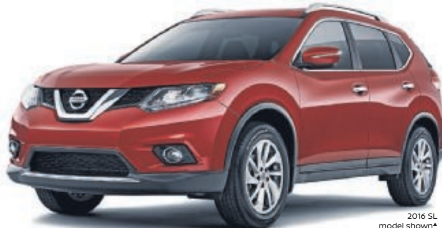
2016 SL model shown*

GET TOTAL DISCOUNTS EQUAL TO 15% OF MSRP ON REMAINING 2016 ROGUE MODELS WHEN FINANCING AT STANDARD RATES WITH NCF INCLUDES UP TO $1,000 INCREMENTAL BOXING DAYS BONUS ON SV MODELS