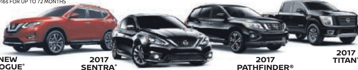
THE NEW 2017 ROGUE®