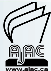
AUTOMOBILE JOURNALISTS ASSOCIATION OF CANADA 2016 SORENTO BEST NEW SUV ($35,000 - $60,000)