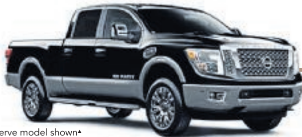
Platinum Reserve model shown*