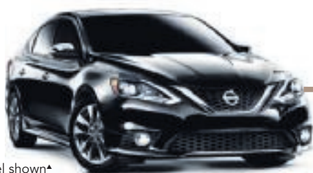
SR model shown*