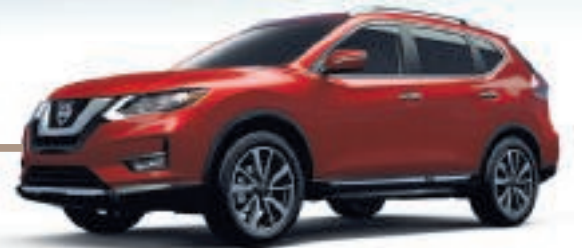
SL model shown*

TOTAL STANDARD RATE FINANCE INCENTIVES INCLUDES $600 AFTER TAX LOYALTY/ CONQUEST INCENTIVE ON REMAINING 2016 ROGUE SL