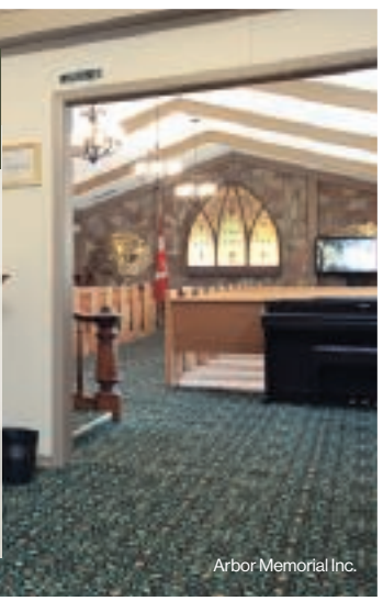
Arbor Memorial Inc.

O'Neill Funeral Home by Arbor Memorial 6324 Main Street, P.O. Box 639, Stouffville oneillfuneral.ca