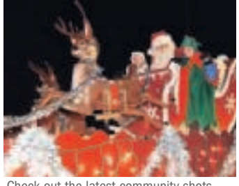
Check out the latest community shots from our photographers www.yorkregion.com/photos