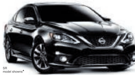
SR model shown*