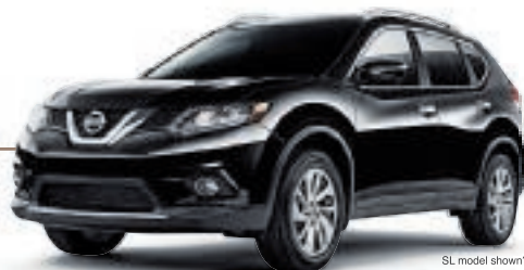
SL model shown*

INCLUDES $600 AFTER TAX LOYALTY/ CONQUEST INCENTIVE ON 2016 ROGUE SL 2016 ROGUE®