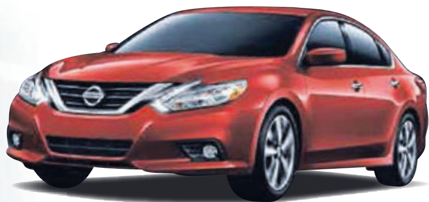
2016 Altima SL model shown

2016 ROGUE IS AWARDED WITH 2016 IIHS TOP SAFETY PICK When equipped with Forward Emergency Braking