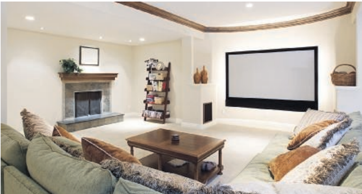
Soundproofing is the ultimate solution to maximize your basement's peace, quiet and privacy.

I've seen a lot of poorly executed basement renos, where the contractor comes in, throws up some studs, tosses