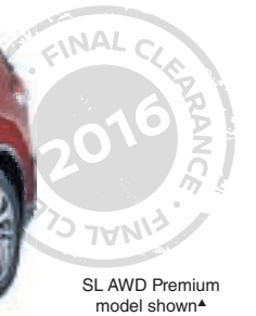
SL AWD Premium model shown ^

STANDARD RATE FINANCE CASH UP TO $5,000 + ON 2016 ROGUE SL PREMIUM