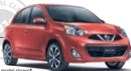
SR AT model shown ^