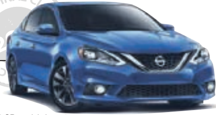
1.8 SR model shown ^