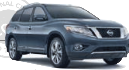
Platinum model shown ^

STANDARD RATE FINANCE CASH UP TO $6,000 +