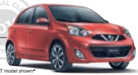
SR AT model shown ^

REBATE UP TO $2,250 ^ ON 2016 MICRA SR MODELS WHEN CASH PURCHASING OR FINANCING AT STANDARD RATES