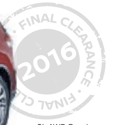
SL AWD Premium model shown ^

STANDARD RATE FINANCE CASH UP TO $5,000 + ON 2016 ROGUE SL PREMIUM