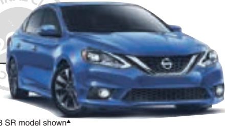
1.8 SR model shown ^

CLEARANCE CASH UP TO $3,750 * ON 2016 SENTRA S MT