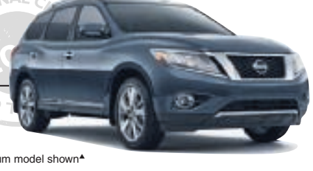
Platinum model shown ^

STANDARD RATE FINANCE CASH UP TO $6,000 + ON 2016 PATHFINDER PLATINUM