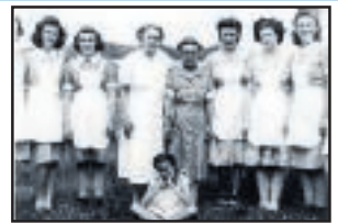
EXHIBIT: FIT TO BE TIED October 18 - December 10 From the functional cotton aprons of our great-grandmothers to the embroidered, beribboned and decorative accessories of the 1970's housewife, aprons trace the changing history of the role of women as they run the household. This exhibit is included with general admission and can be viewed during Museum's regular hours of operation.

GHOU-ICIOUS Saturday, October 29 • 1:00pm - 2:30pm Bring your little ghouls to the Museum! Come dressed in a costume to decorate a loot bag, make a Halloween treat, and go trick-or-treating! Recommended ages: 3 to 10. Pre-registration required.